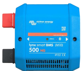
Lynx Smart BMS NG 500A