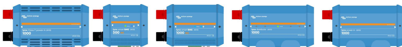
Lynx Distribution products with M10 busbars