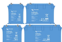
Lithium NG Battery 12,8 V, 25,6 V & 51,2 V