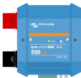
Lynx Smart BMS NG 500 A