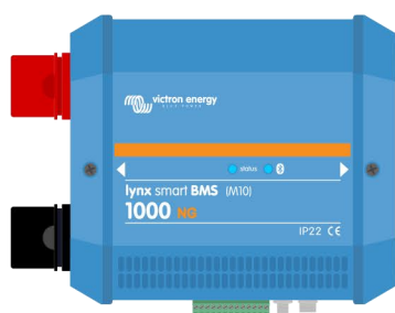
Lynx Smart BMS NG 1000 A