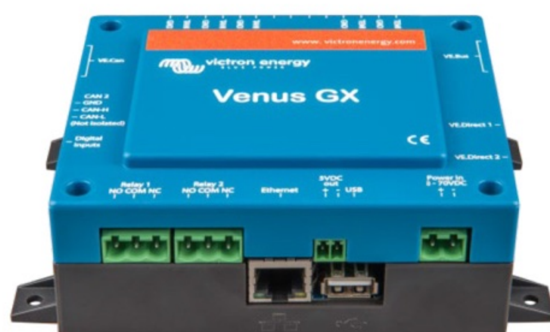
Venus GX front angle