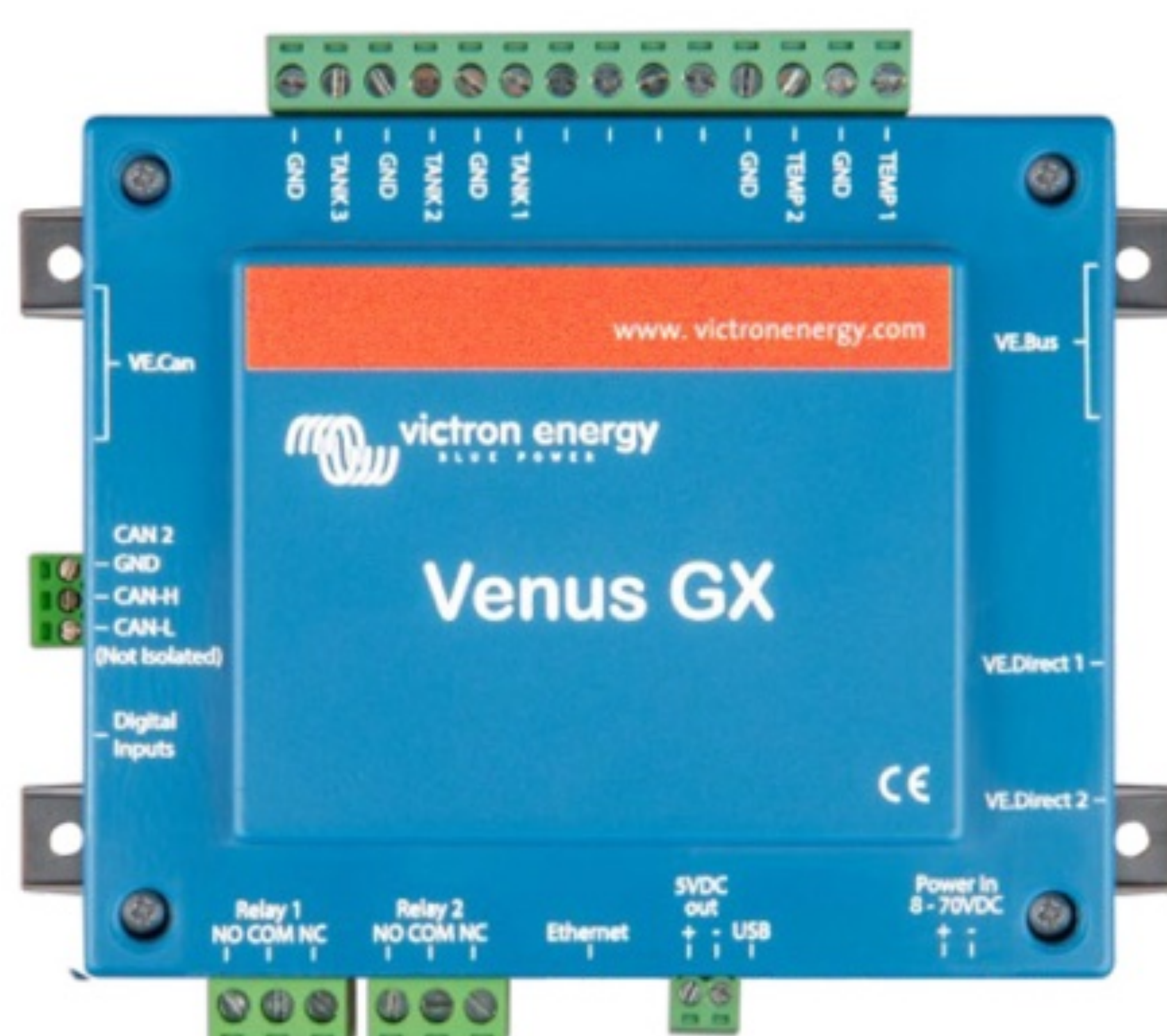
Venus GX with connectors