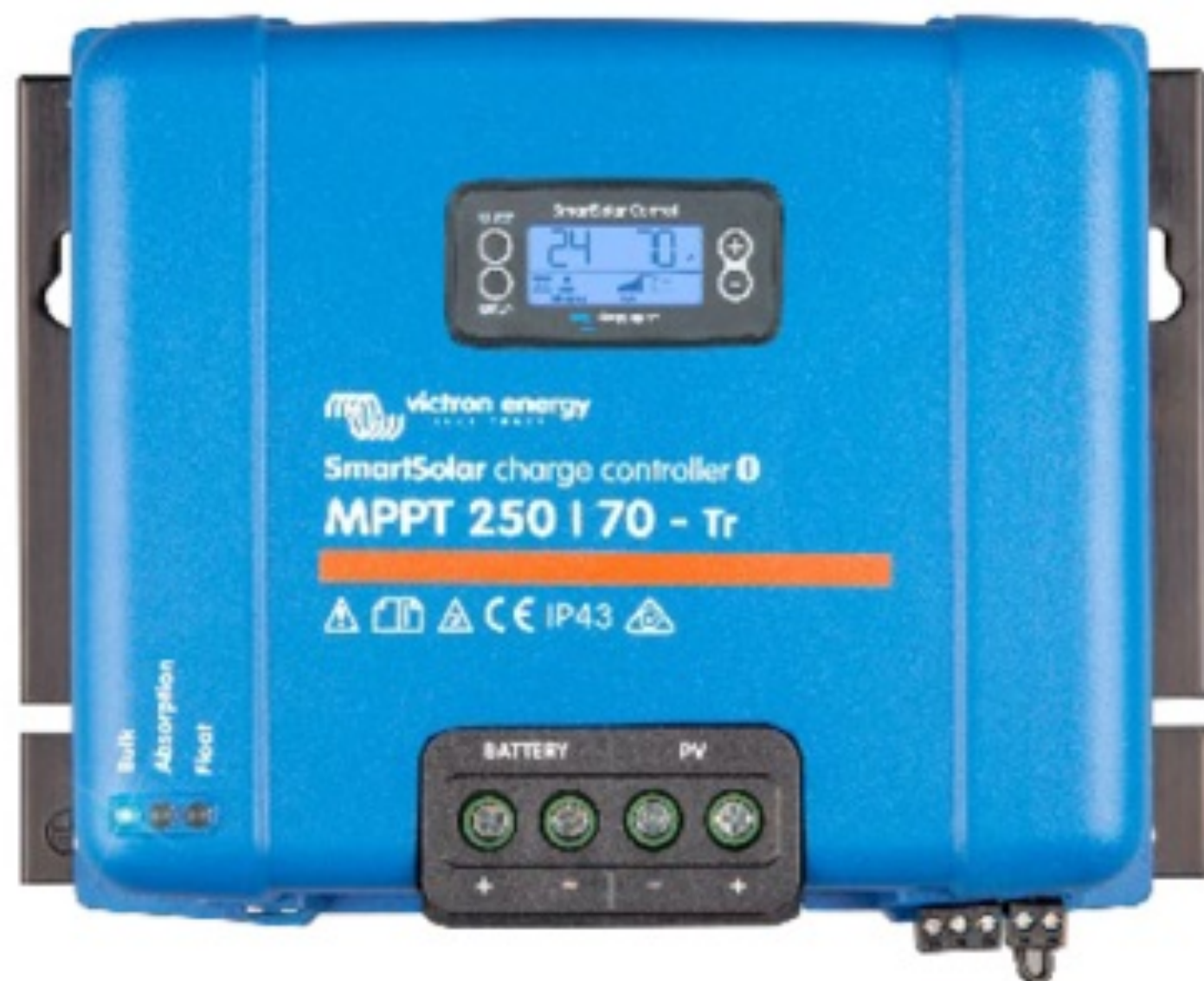
SmartSolar Charge Controller MPPT 250/70-Tr with optional pluggable display