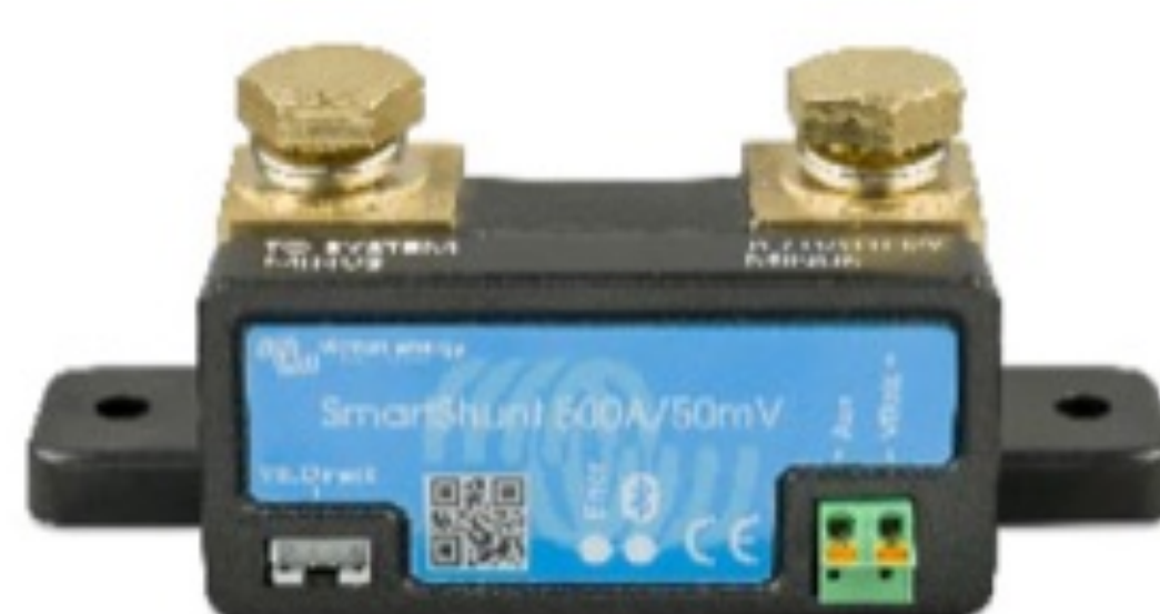
Bluetooth sensing: SmartShunt