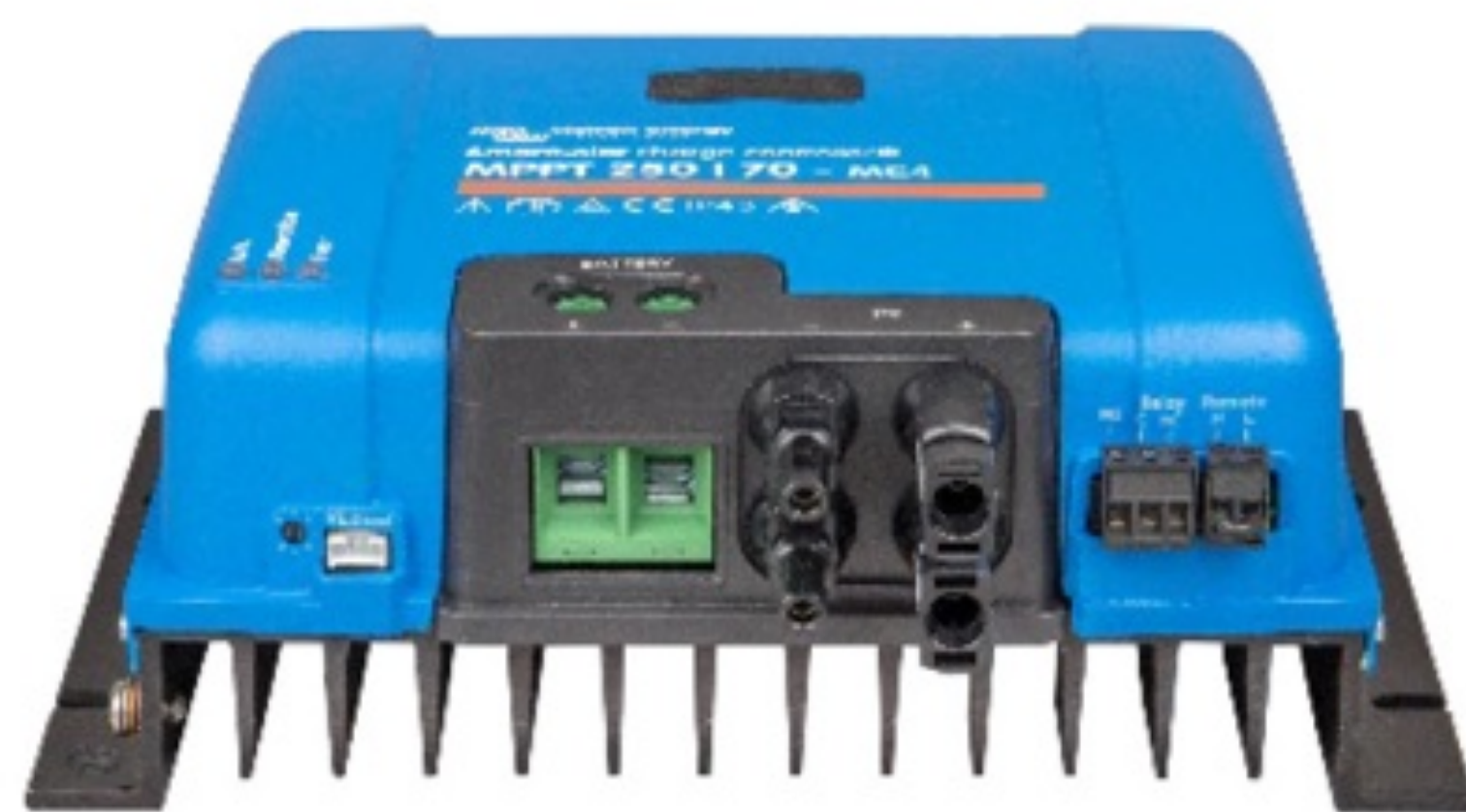
SmartSolar Charge Controller MPPT 250/70-MC4 without display