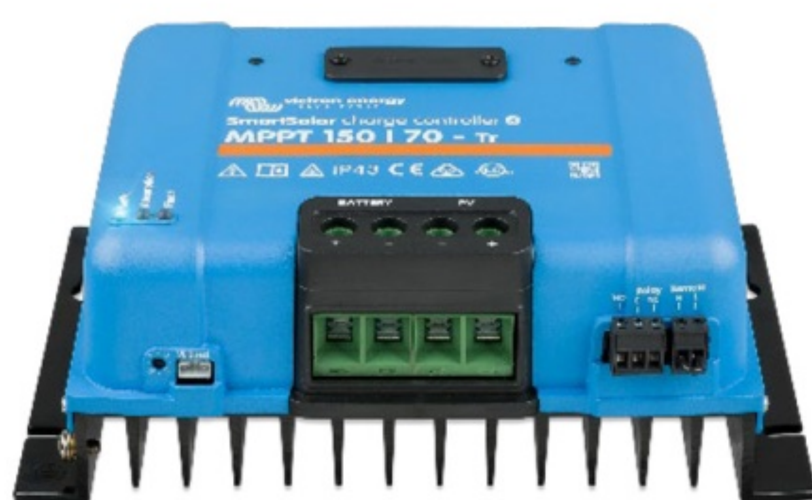
SmartSolar Charge Controller MPPT 150/70-Tr without optional display