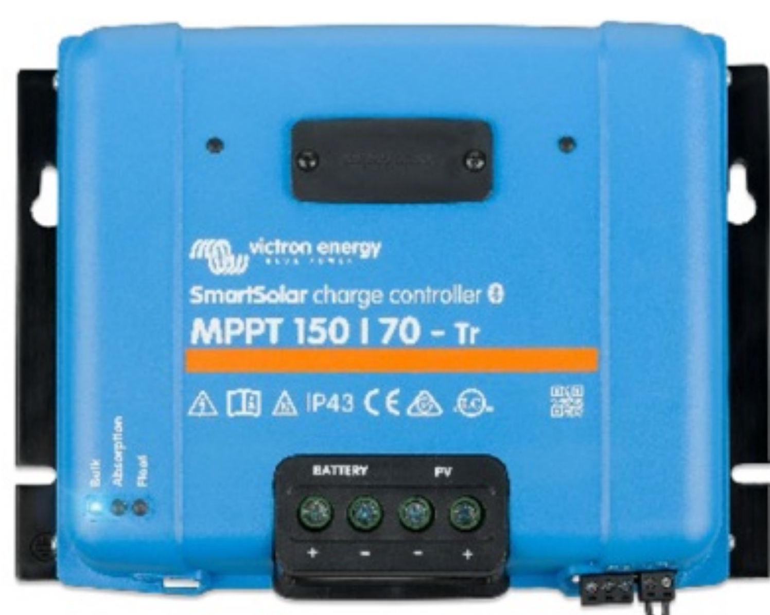
SmartSolar Charge Controller MPPT 150/70-Tr without optional display