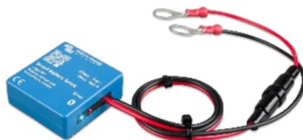
Bluetooth sensing Smart Battery Sense