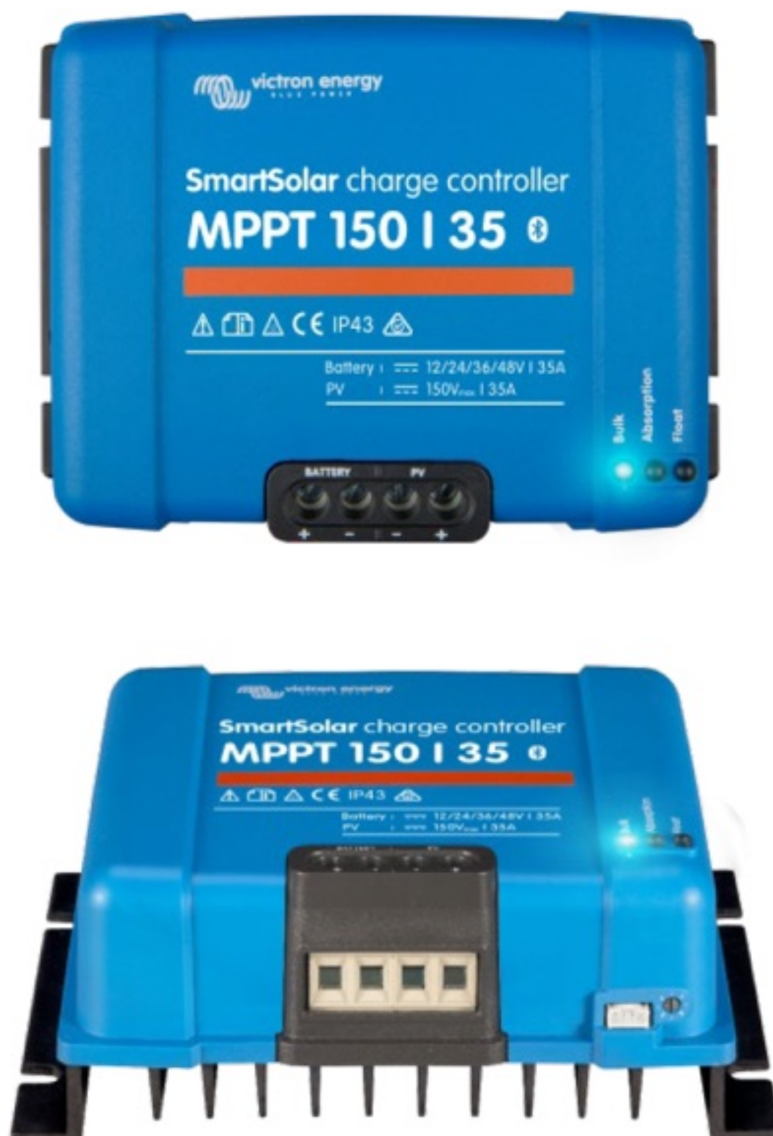
SmartSolar Charge Controller MPPT 150/35