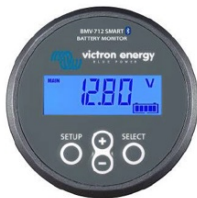
Bluetooth sensing BMV-712 Smart Battery Monitor