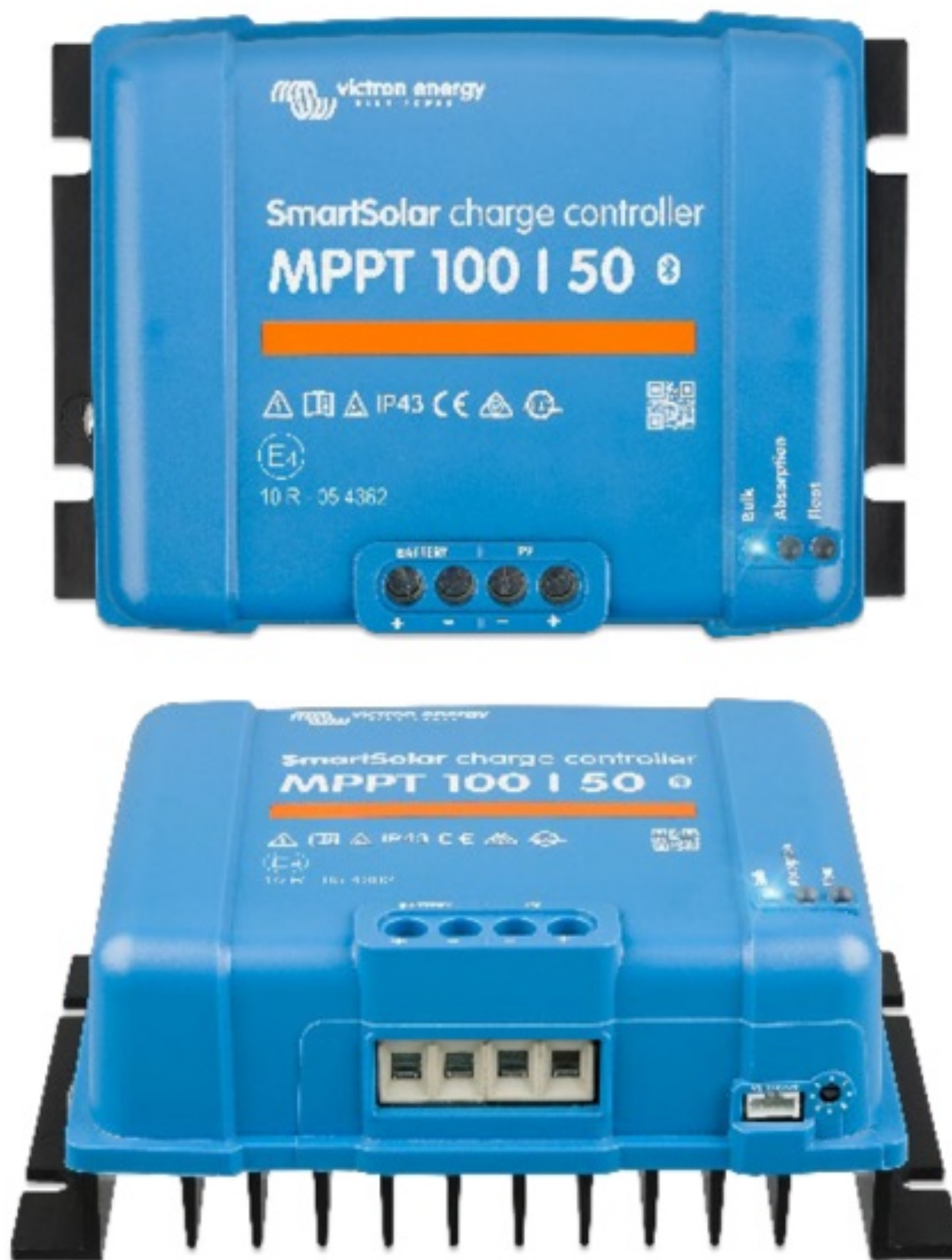
SmartSolar Charge Controller MPPT 100/50