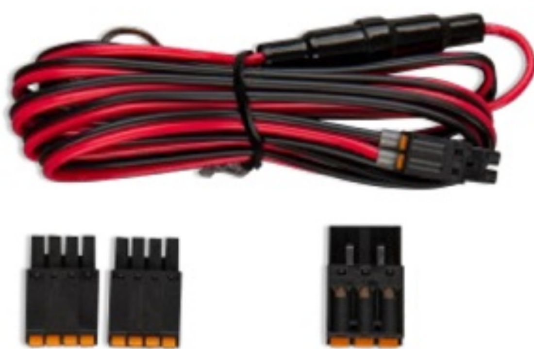
Accessories included with the GlobalLink 520