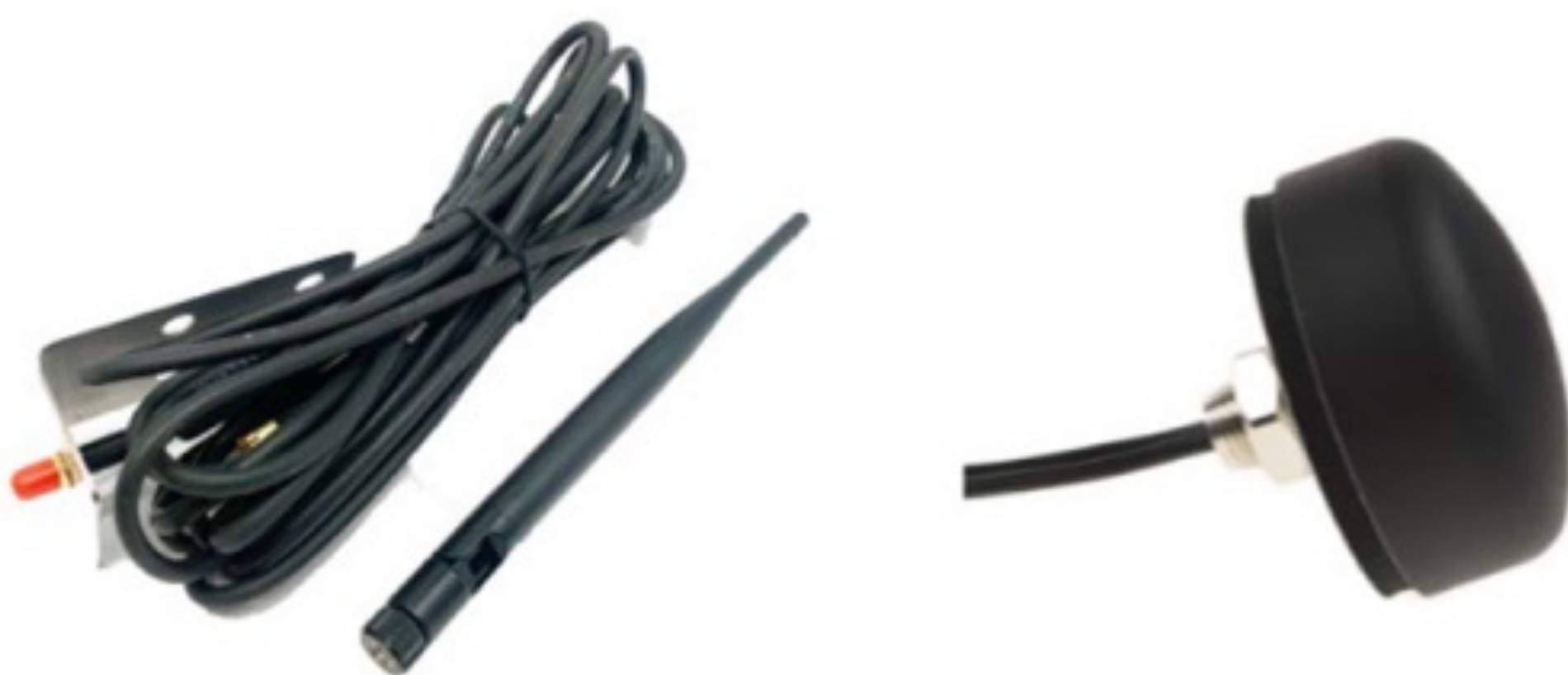
Optional Outdoor LTE-M wall-mount antenna (ANT100200100)