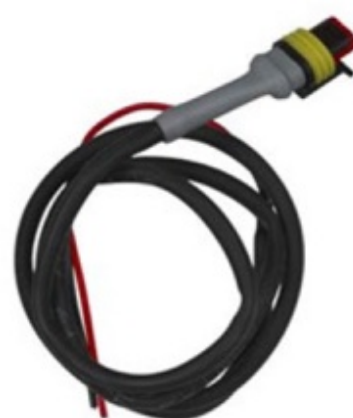
Control cable for Cyrix-ct 12/24-230 Length: 1 m