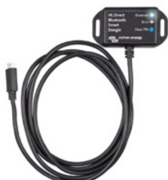
VE.Direct Bluetooth Smart Dongle