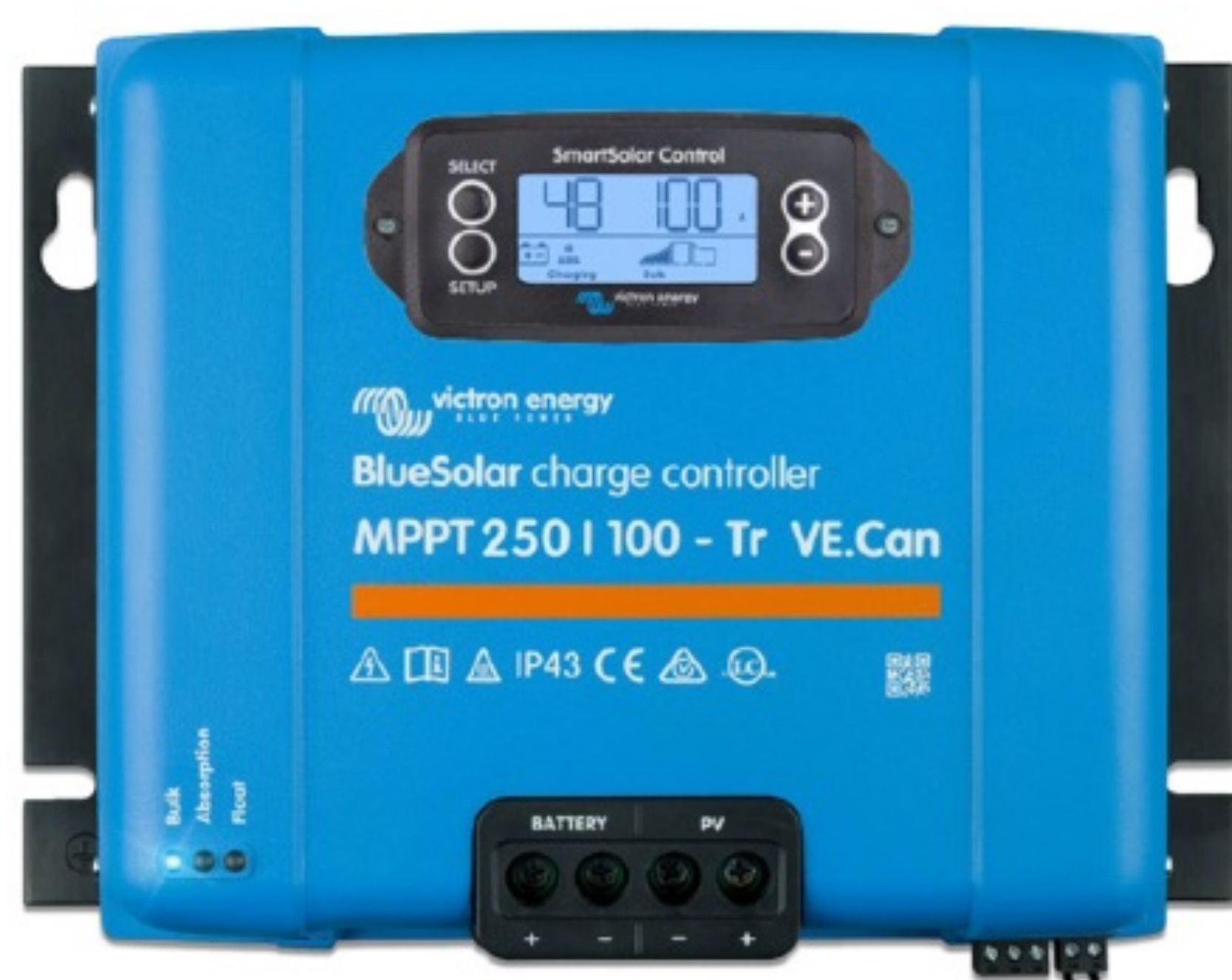
BlueSolar Charge Controller MPPT 250/100-Tr VE.Can with optional display