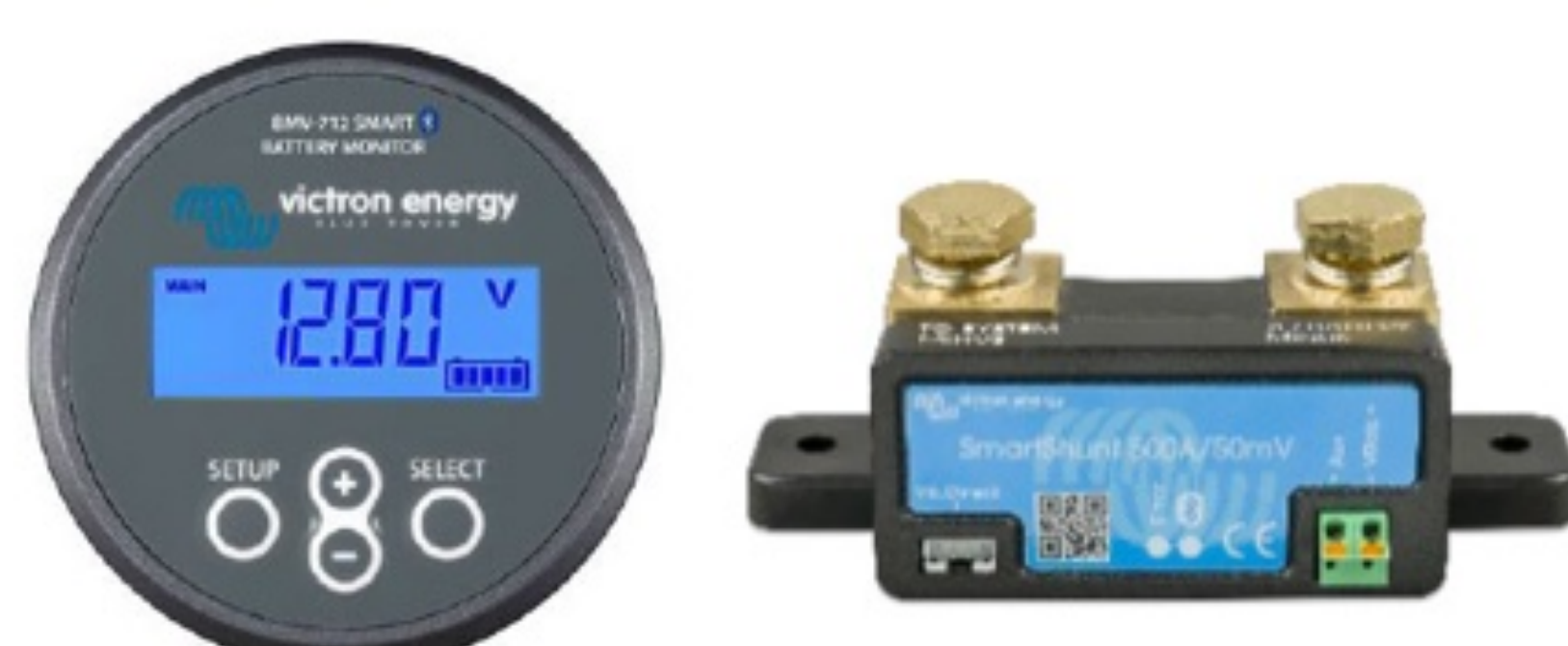
Bluetooth sensing: BMV-712 Smart Battery Monitor or SmartShunt