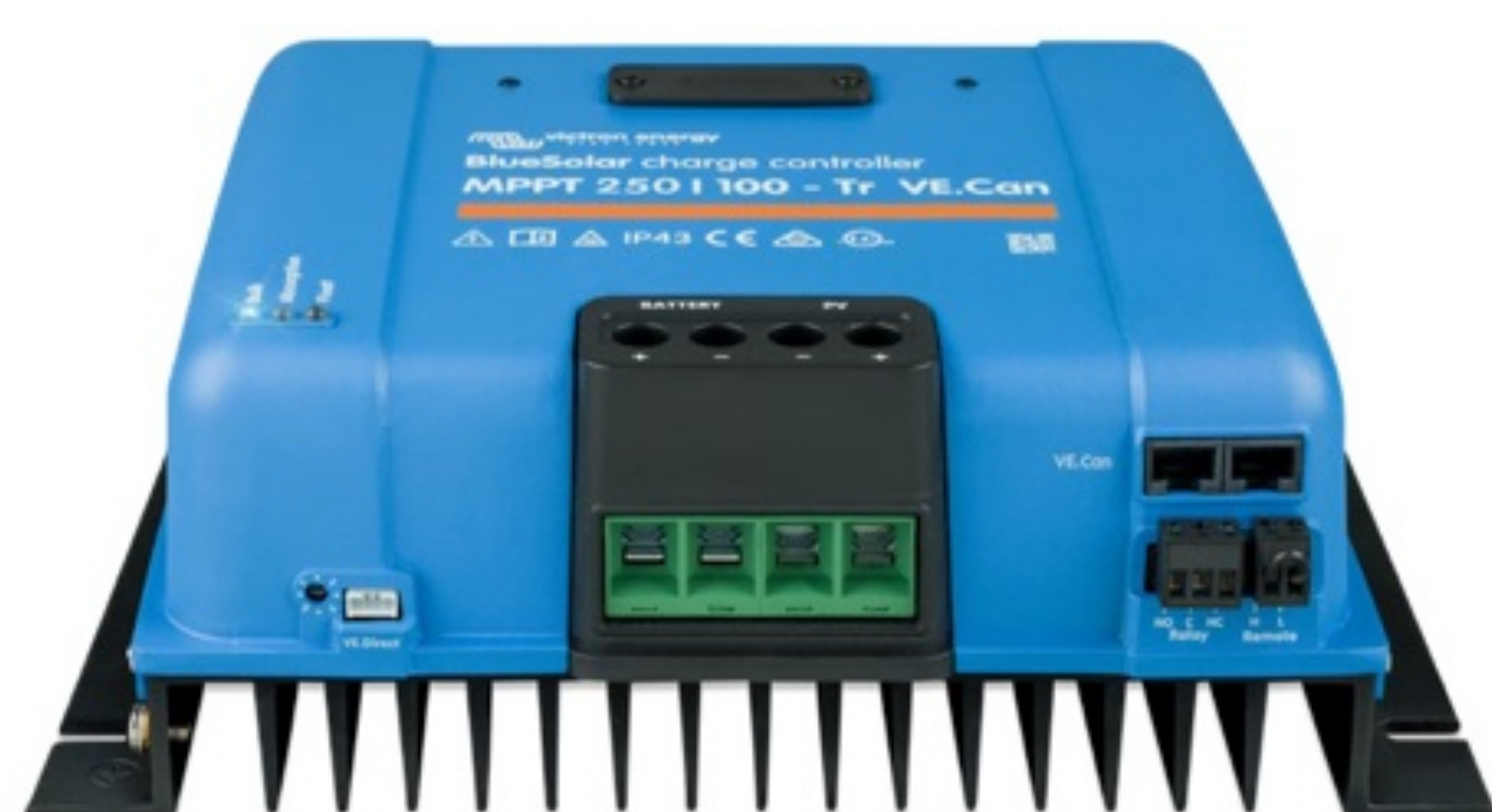
BlueSolar Charge Controller MPPT 250/100-Tr VE.Can without display