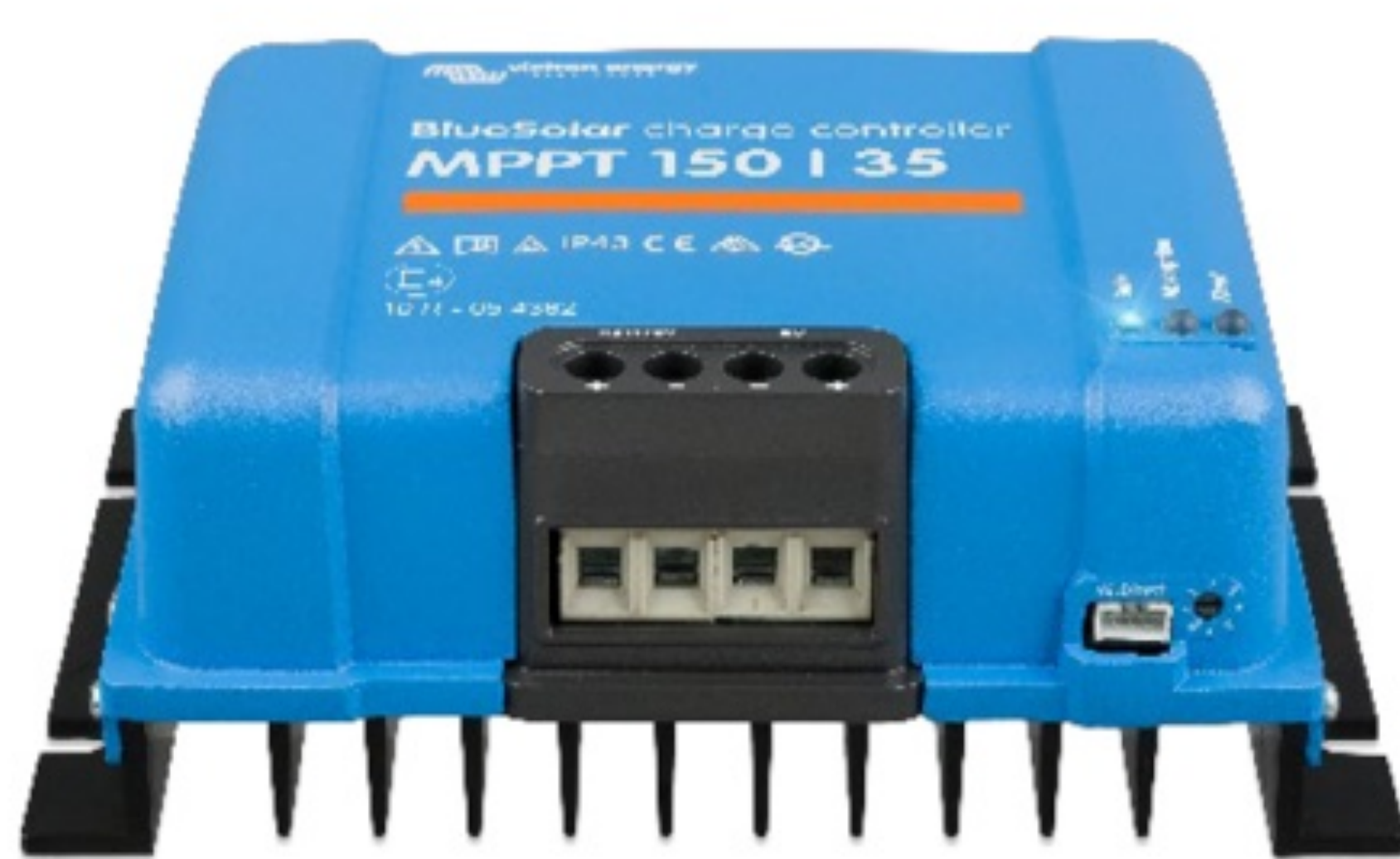
Solar Charge Controller MPPT 150/35