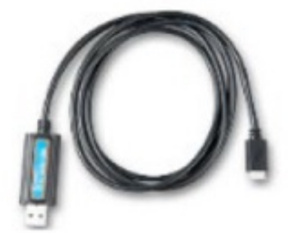
VE.Direct to USB interface