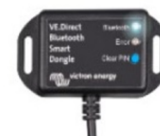
VE.Direct Bluetooth Smart Dongle