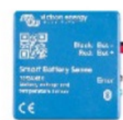
Smart Battery Sense