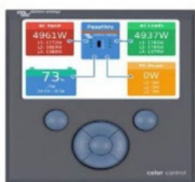
Color Control GX