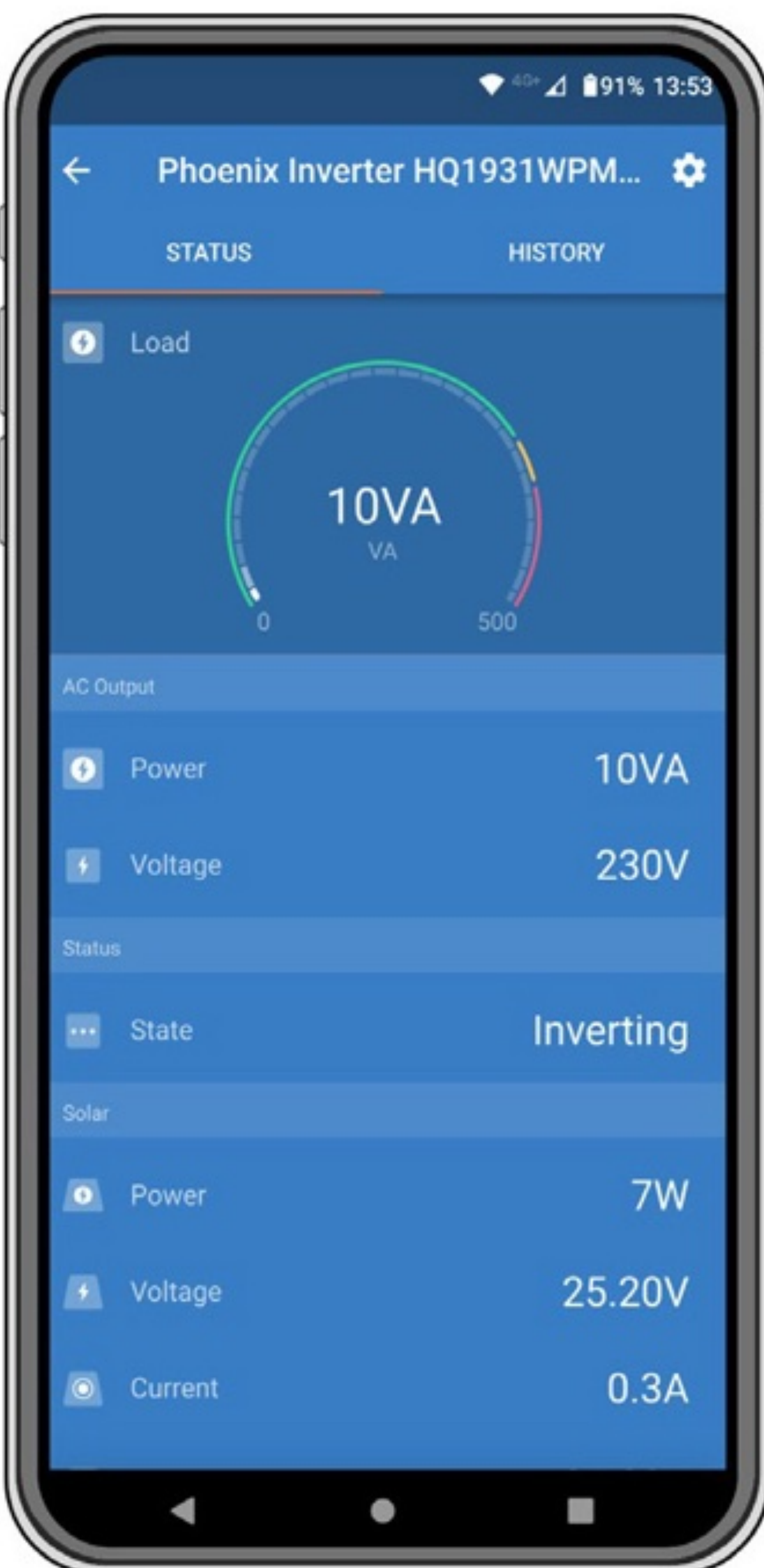
The VictronConnect app