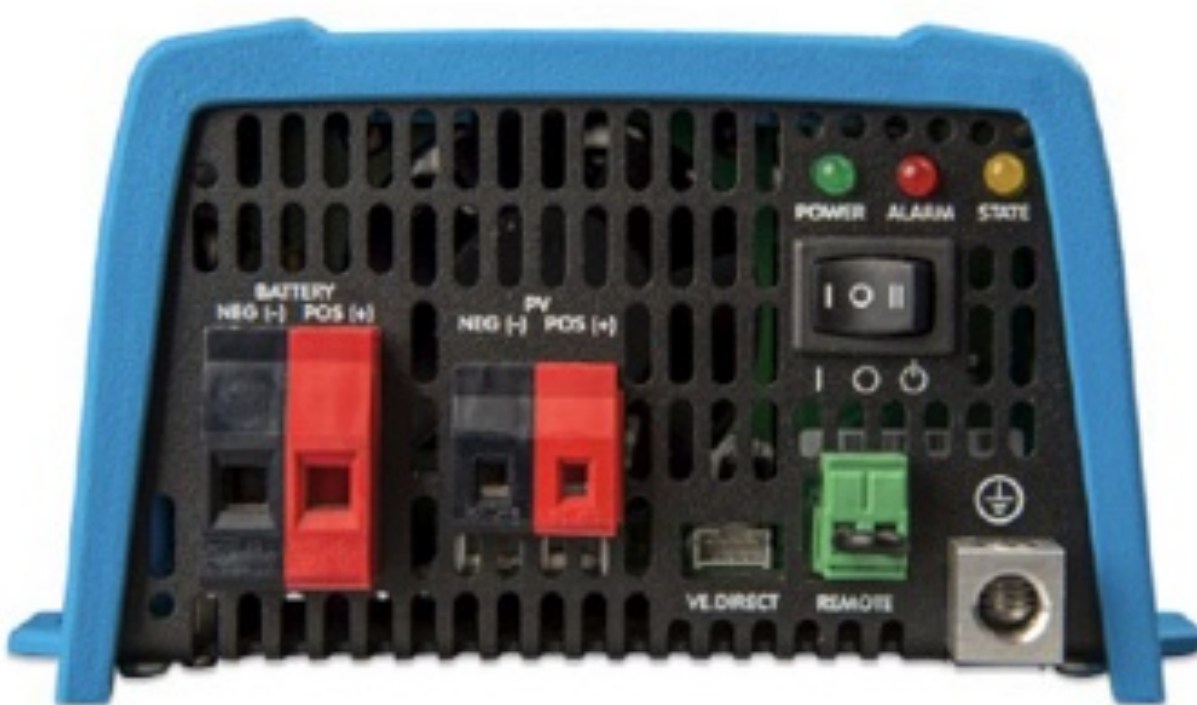
Sun Inverter 12/250