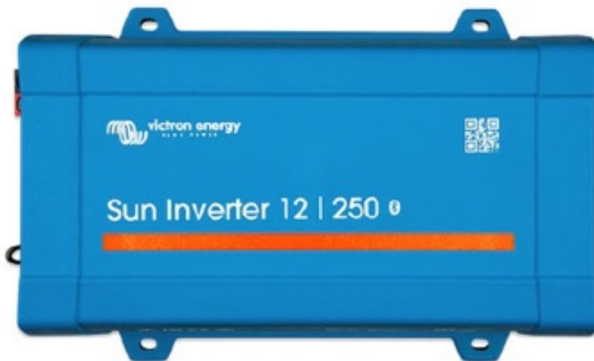
Sun Inverter 12/250

12V | 250VA and 24V | 250VA - 230V, 50Hz or 60Hz