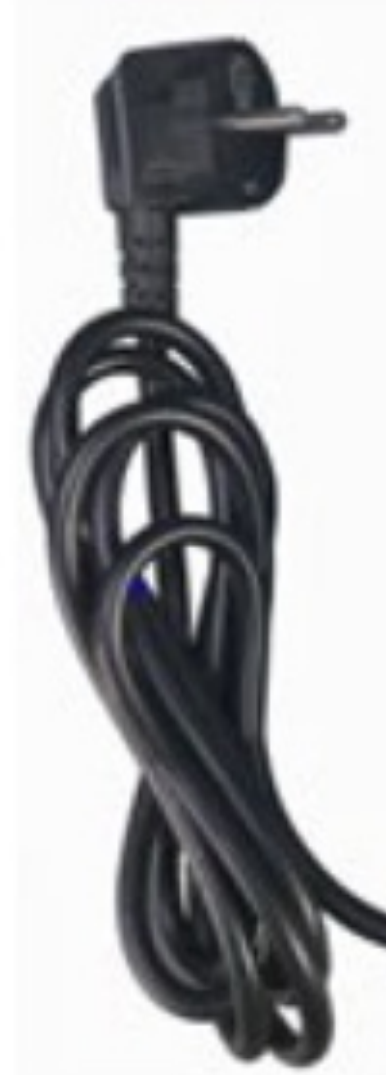
AC cord (must be ordered separately)

Plug options: Europe: CEE 7/7 UK: BS 1363 Australia/New Zealand: AS/NZS 3112