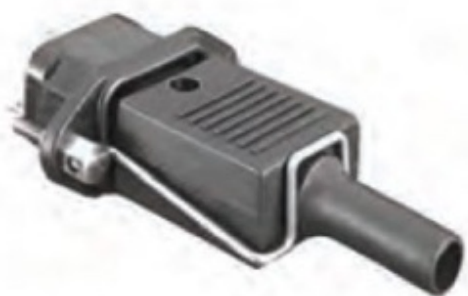
Retainer clip (included)