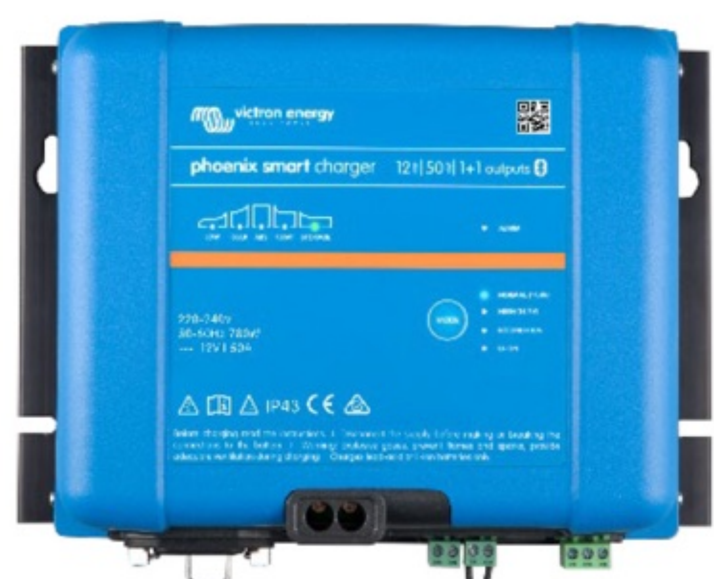
Smart IP43 Charger 12/50 (1+1)