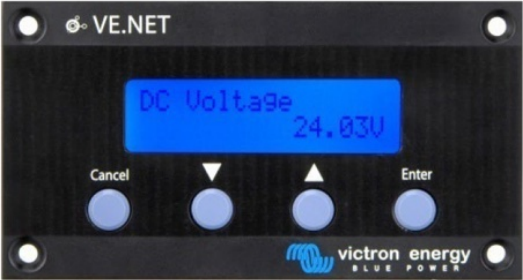
Remote panel GMDSS The remote panel allows easy access to all important data. Alarm settings are pre-set but can also be reprogrammed.