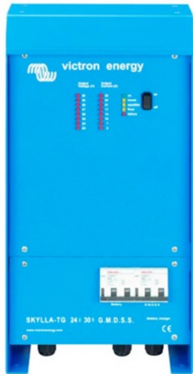
Skylla TG 24 30 GMDSS