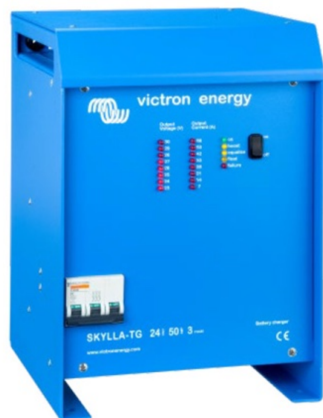
Skylla TG 24 50 3-phase

To learn more about batteries and charging batteries, please refer to our book 'Energy Unlimited' (available free of charge from Victron Energy and downloadable from www.victronenergy.com ).