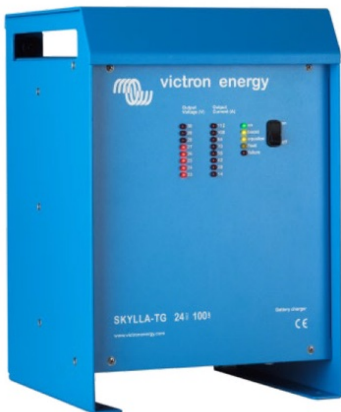
Skylla TG 24 100