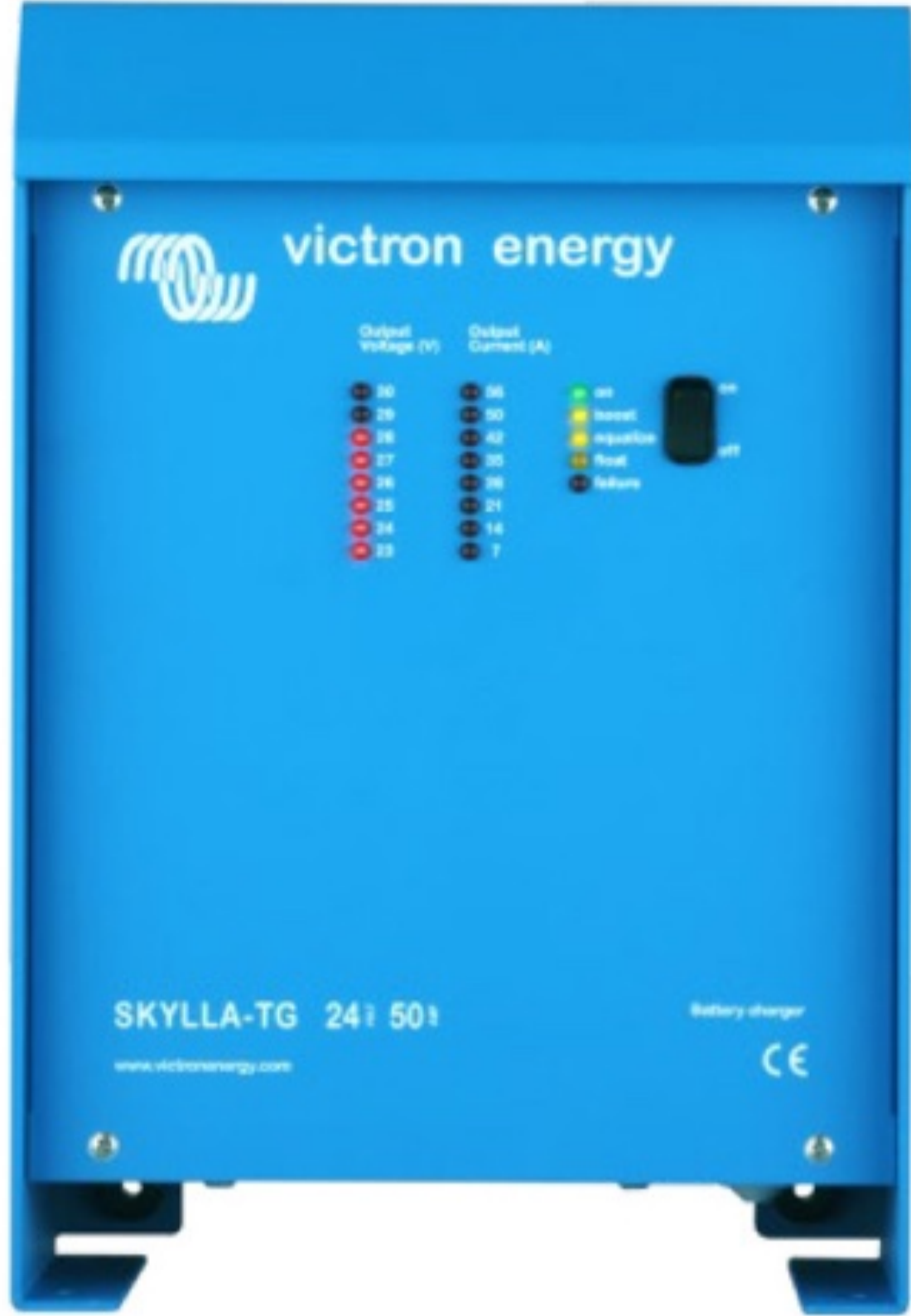
Skylla TG 24 50