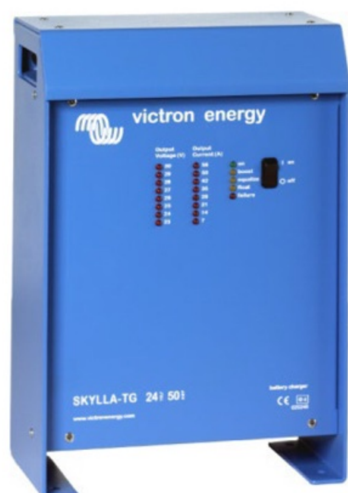
Skylla Charger 24 V 50 A