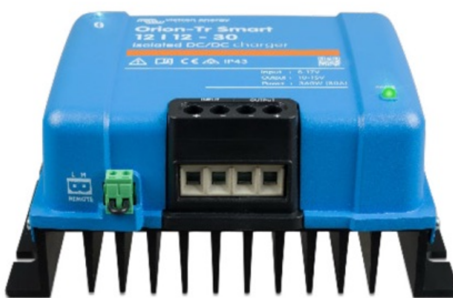
Orion-Tr Smart 12/12-30