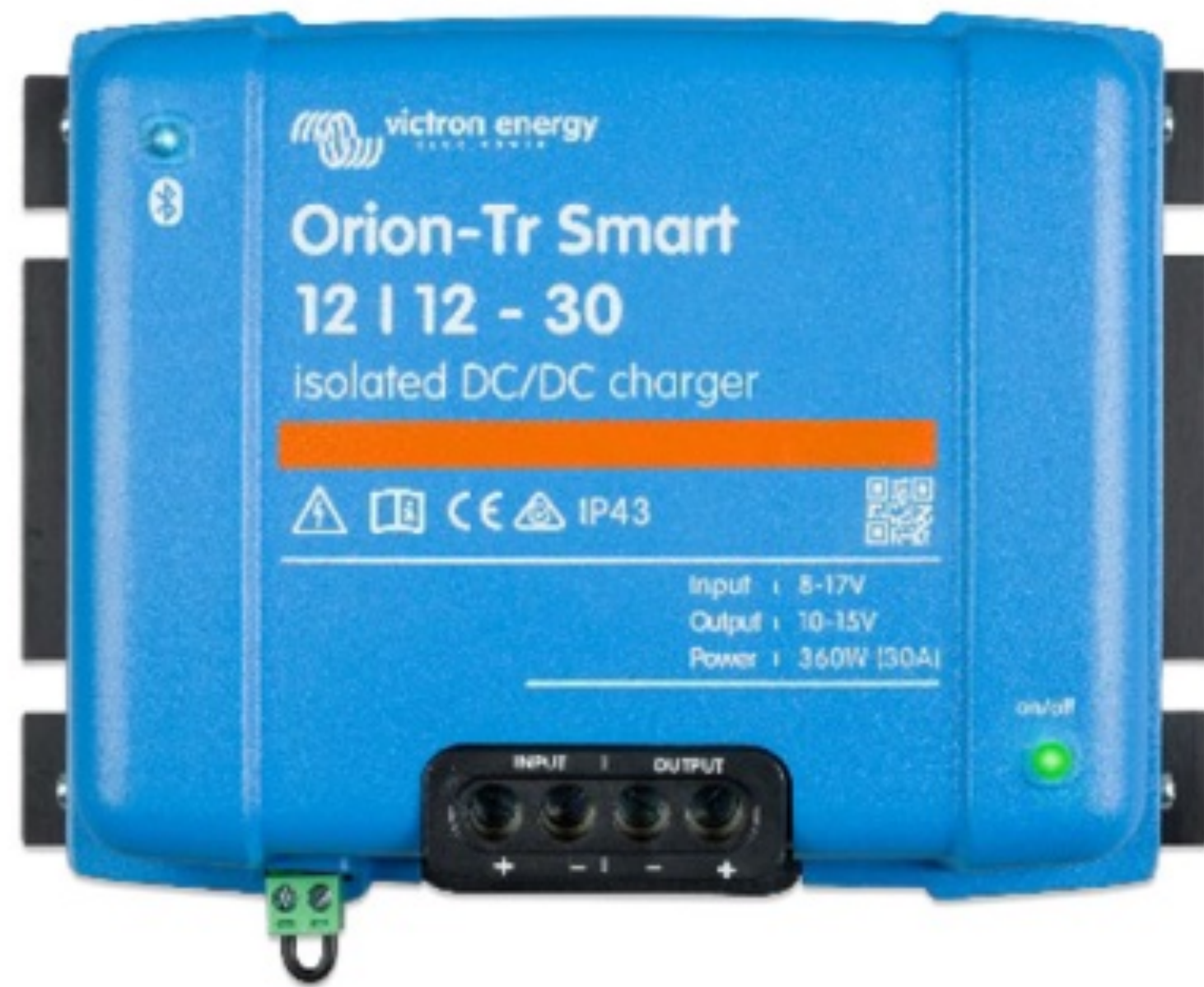
Orion-Tr Smart 12/12-30