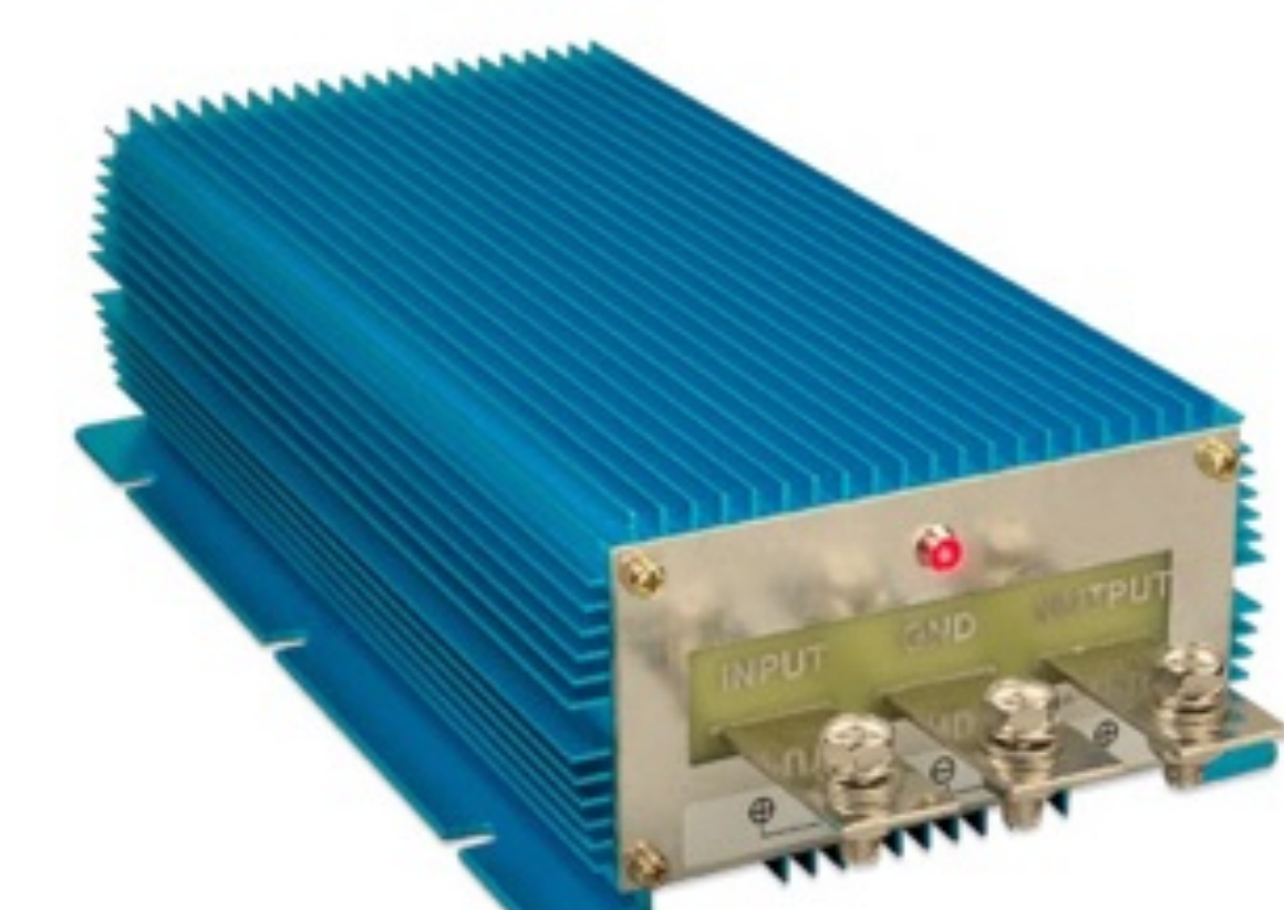
Orion IP67 24/12-100 Orion IP67 12/24-50