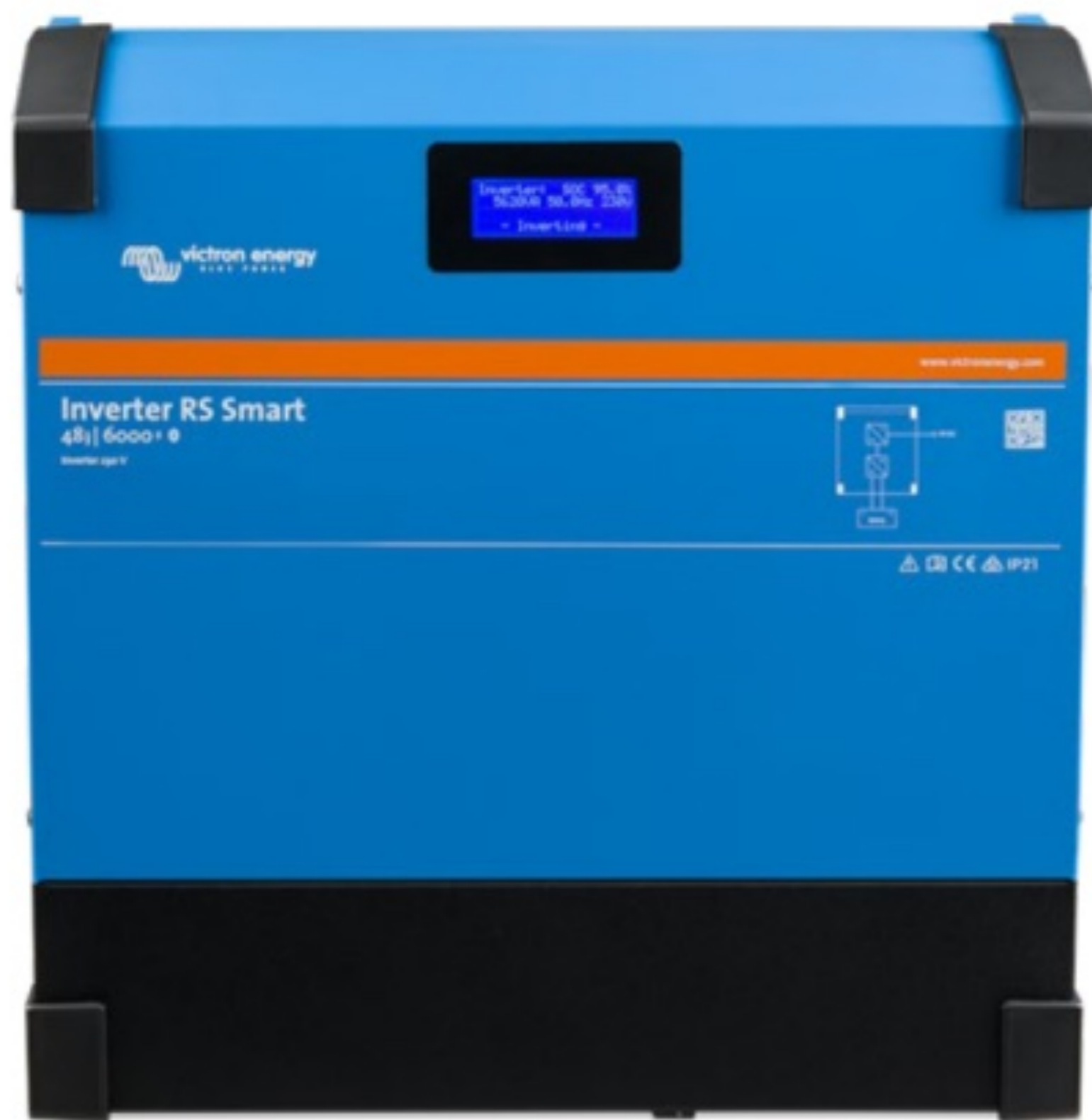
Inverter RS Smart 48/6000