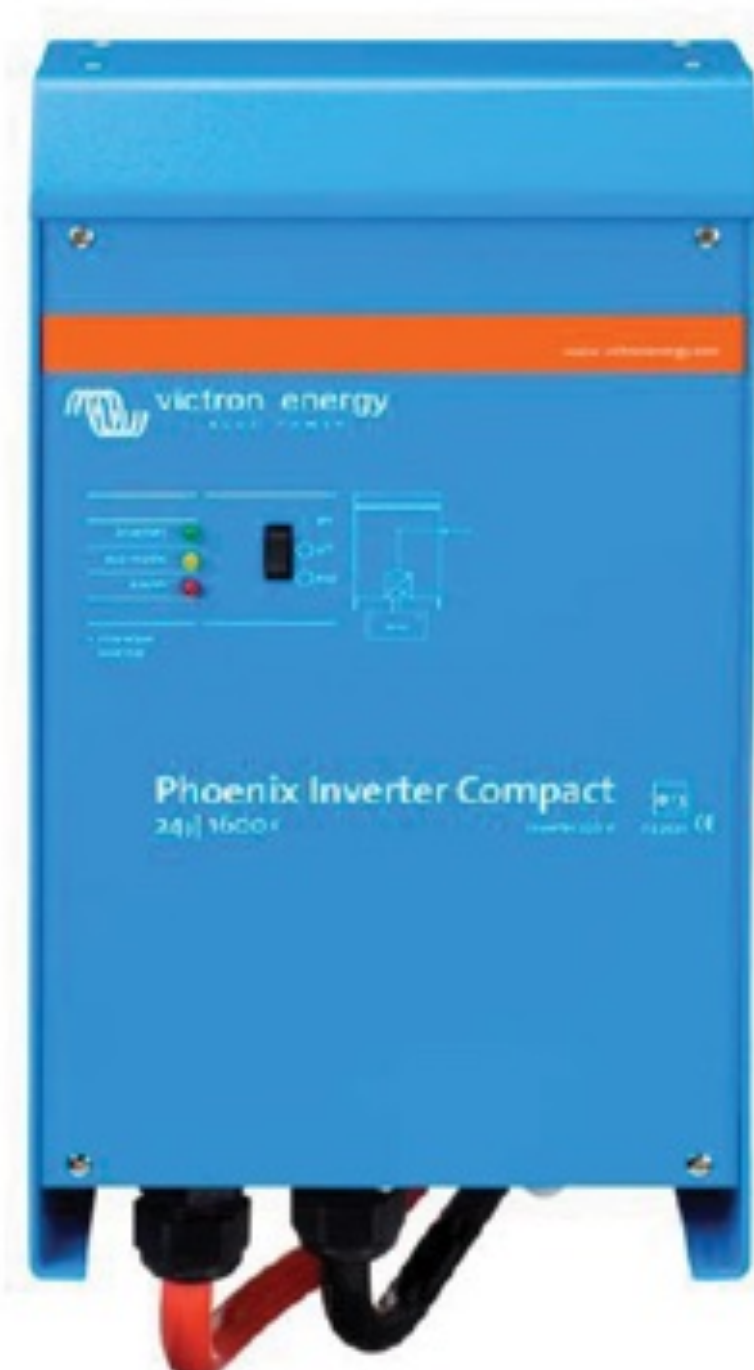
Inverter Compact 24/1600

The possibilities of paralleled high power inverters are truly amazing. For ideas, examples and battery capacity calculations please refer to our book 'Energy Unlimited' (available free of charge from Victron Energy and downloadable from www.victronenergy.com ).