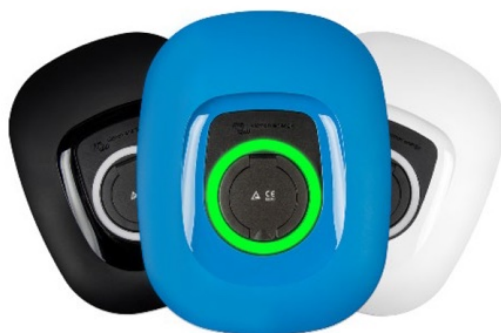
Black, blue (default) or white front