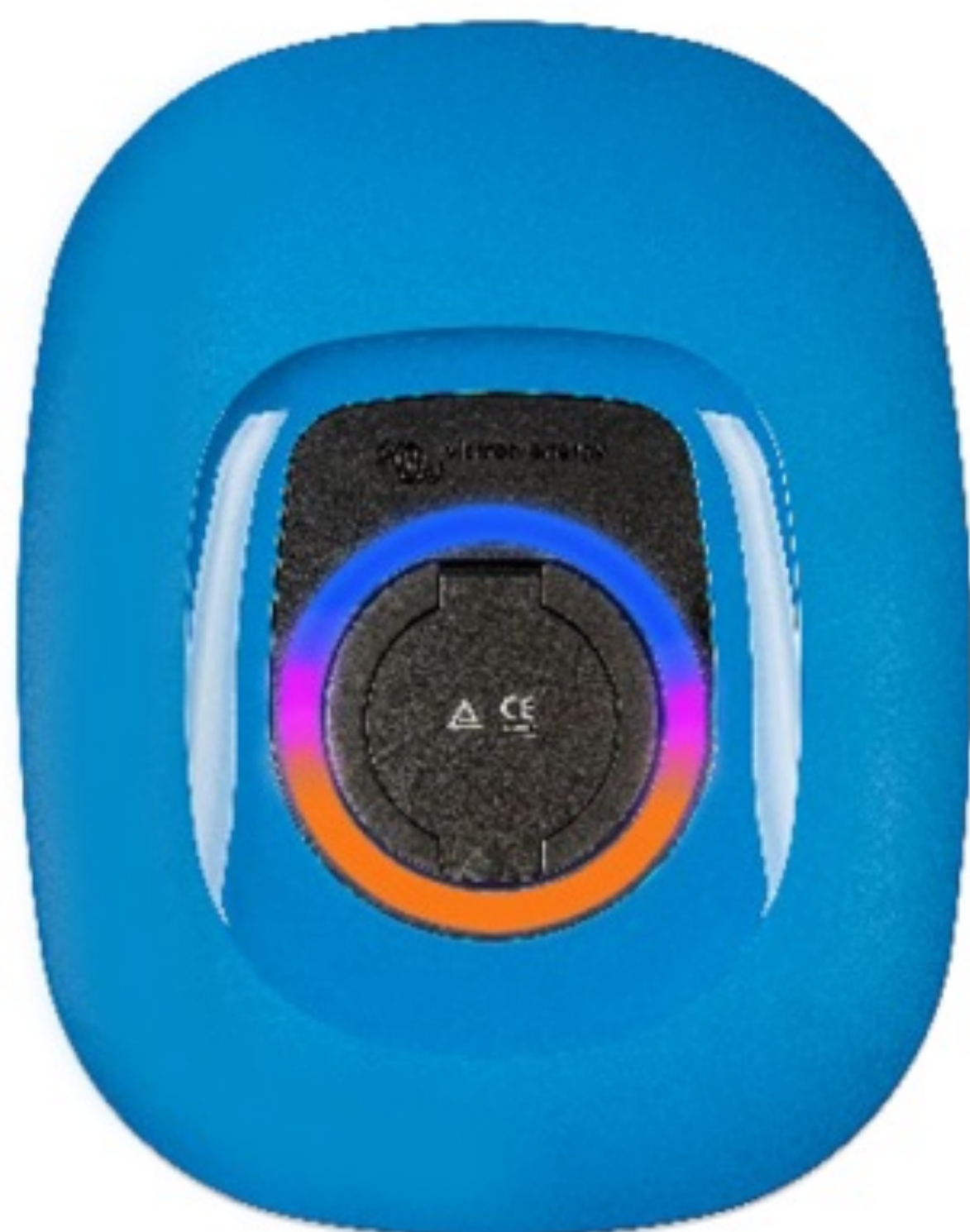
EV Charging Station NS