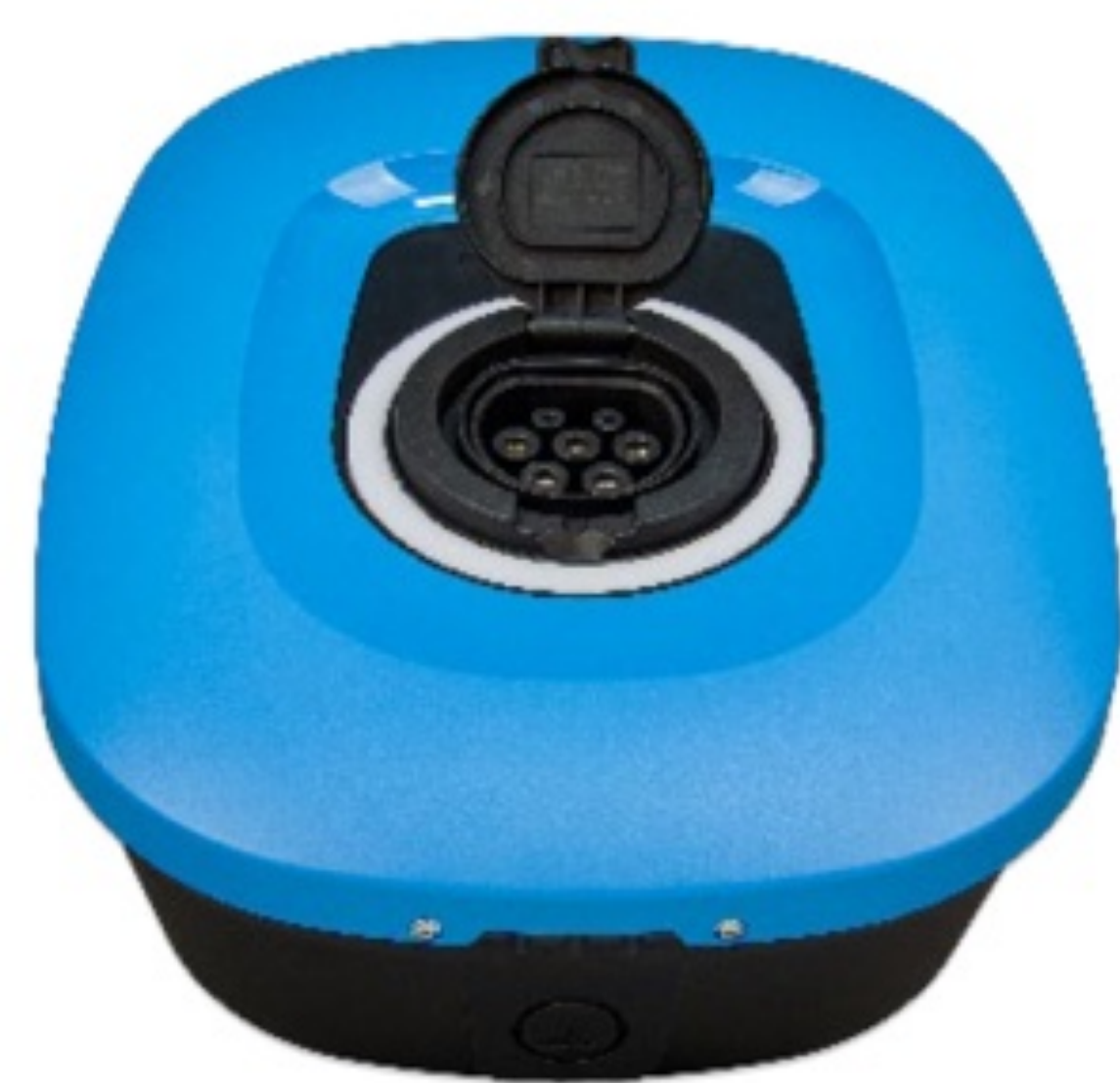
EV Charging Station NS - Front