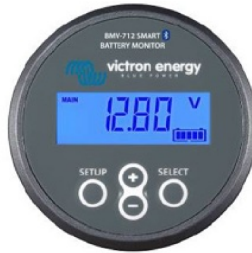
BMV-712 Smart Battery Monitor

BMV-712 Smart Battery Monitor or SmartShunt enables temperature and voltage compensated charging. The battery charge current information can for example be used to switch from absorption charging to float charging at a set battery tail current.