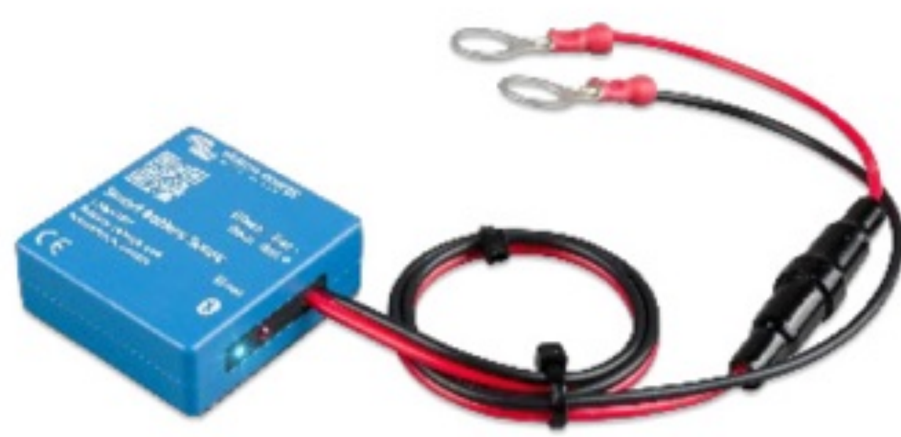
Smart Battery Sense Enables temperature and voltage compensated charging.