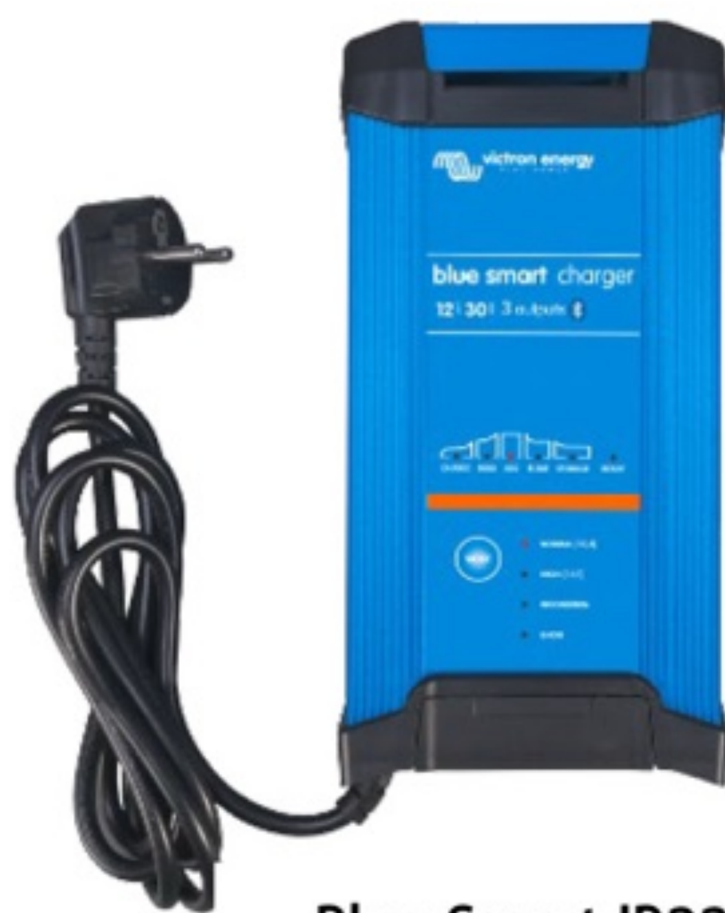
Blue Smart IP22 12/30 (3)