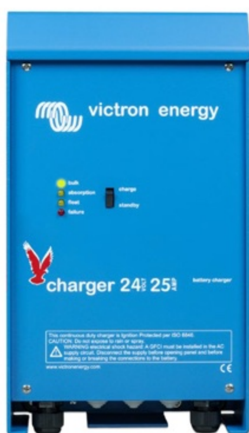
Battery Charger 24 V 25 A

To learn more about batteries and charging batteries, please refer to our book 'Energy Unlimited' (available free of charge from Victron Energy and downloadable from www.victronenergy.com ). For more information about adaptive charging please look under Technical Information on our website.