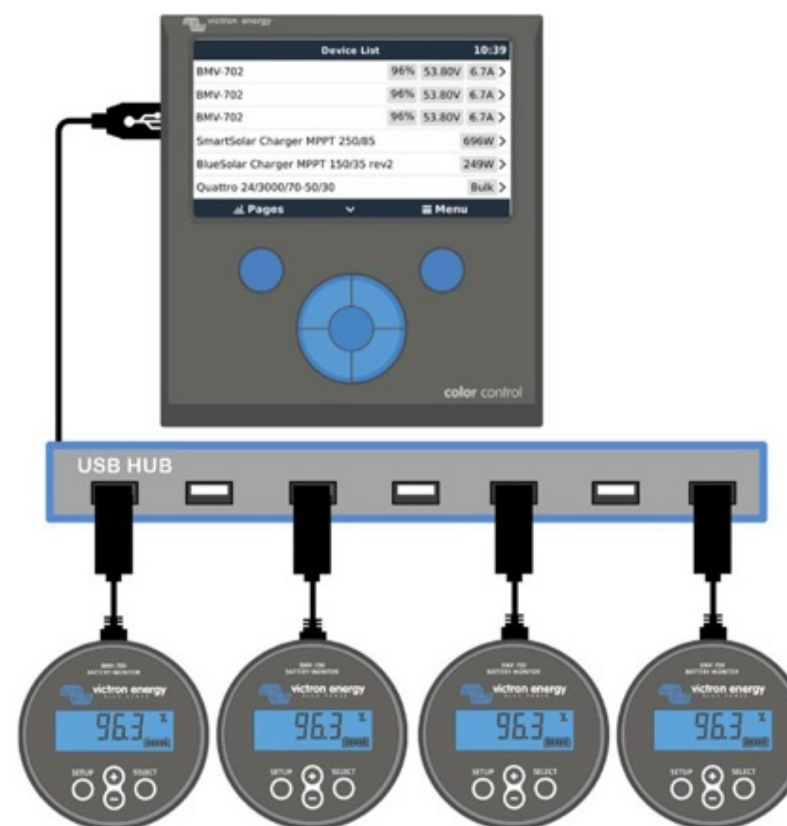
A maximum of four BMVs can be connected directly to a Color Control GX. Even more BMVs can be connected to a USB Hub for central monitoring.