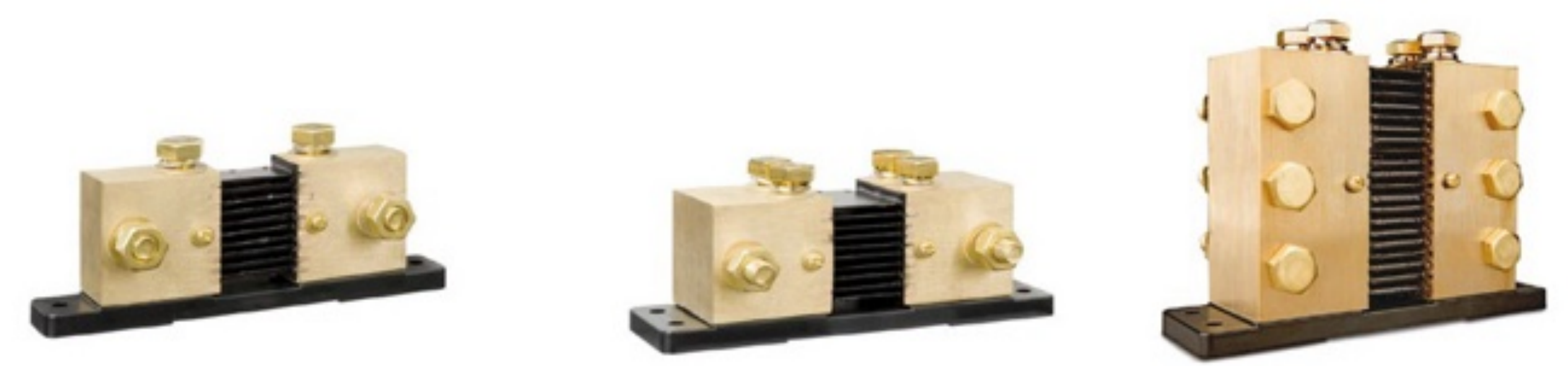
1000A/50mV, 2000A/50mV and 6000A/50mV shunt The quick connect PCB on the standard 500A/50mV shunt can also be mounted on these shunts.