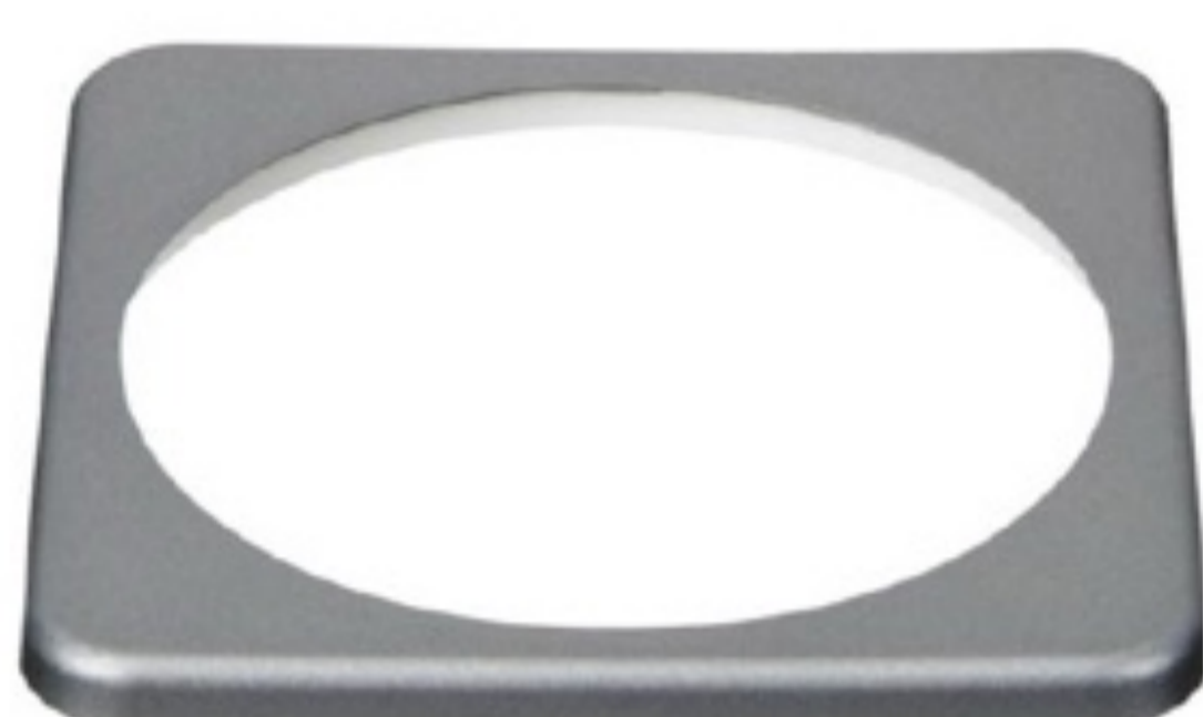
BMV bezel square

We recommend our Battery Balancer (BMS012201000) to maximize service life of series-connected batteries.