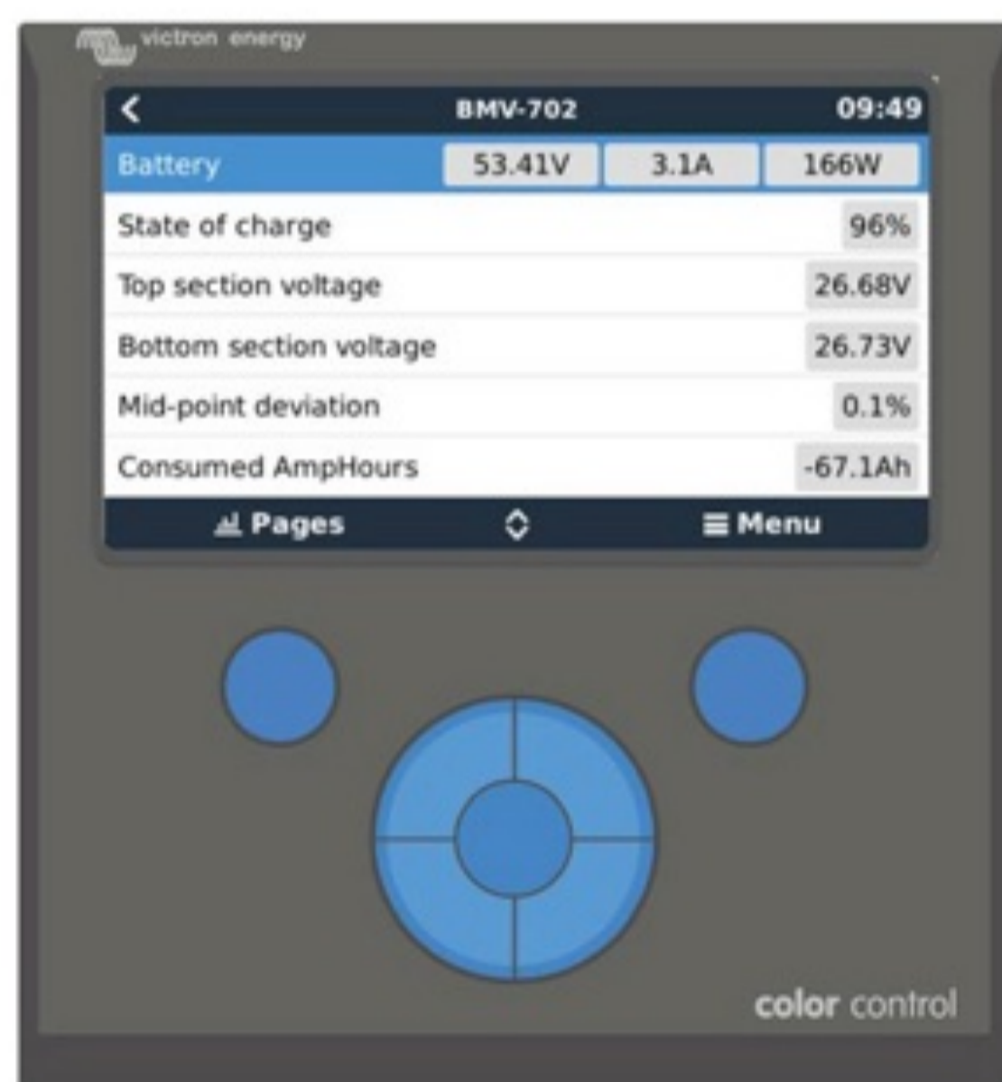
Color Control The powerful Linux computer, hidden behind the colour display and buttons, collects data from all Victron equipment and shows it on the display. Besides communicating with Victron equipment, the Color Control communicates through CAN bus (NMEA2000), Ethernet and USB. Data can be stored and analysed on the VRM Portal.

(the VE.Direct to Bluetooth Smart dongle must be ordered separately)