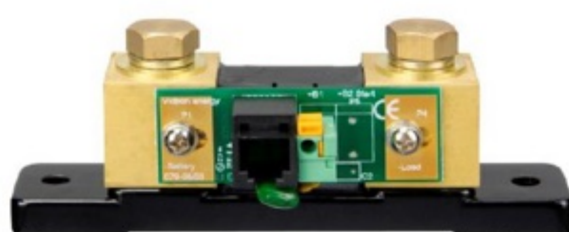
BMV shunt 500A/50mV With quick connect pcb