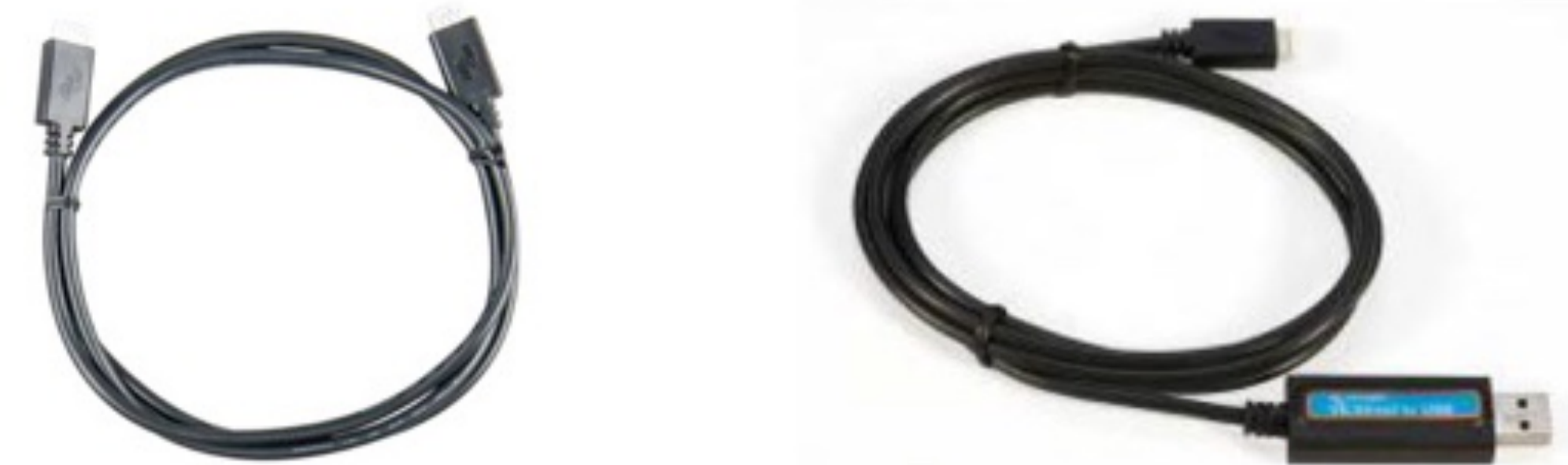
Interface cables - VE.Direct cables to connect a BMV 70x to the Color Control (ASS030530xxx) - VE.Direct to USB interface (ASS030530000) to connect several BMV 70x to a Color Control GX or to a computer.