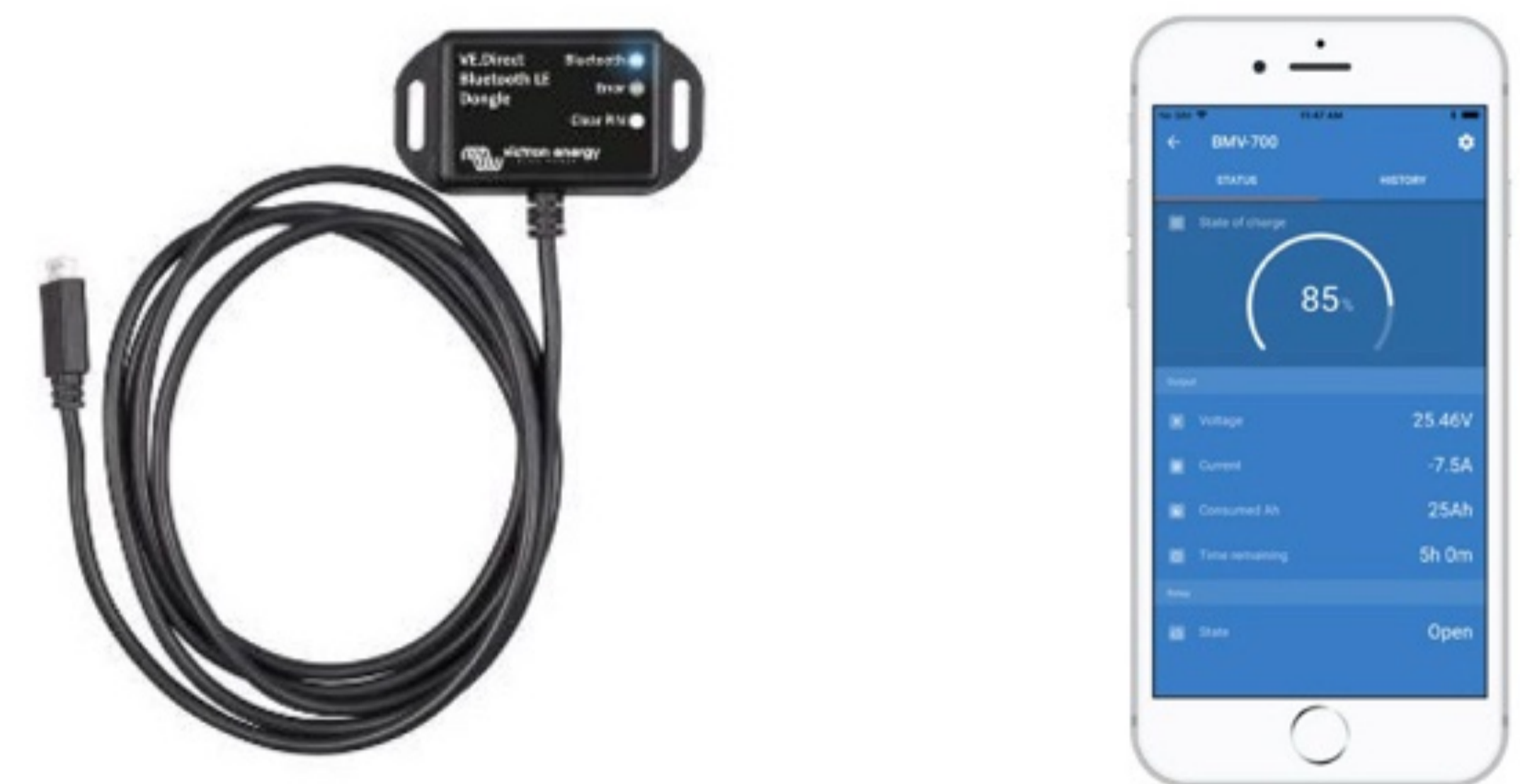
With the VE.Direct to Bluetooth Smart dongle real time data and alarms can be displayed on Apple and Android smartphones, tablets, macbooks and other devices.