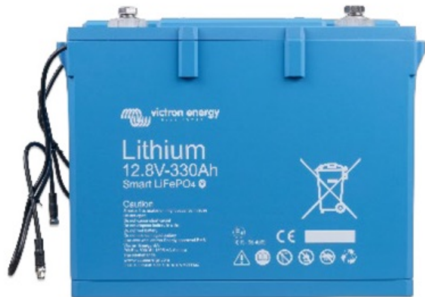
12,8 V 330 Ah LiFePO4 Battery