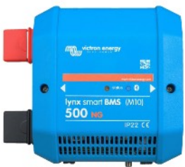
Lynx Smart BMS NG 500A