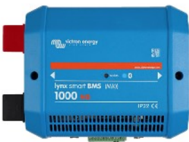
Lynx Smart BMS NG 1000A