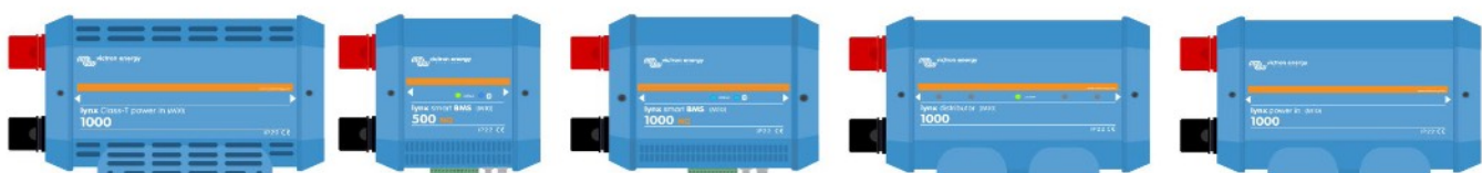
Lynx Distribution products with M10 busbars