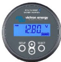
Bluetooth sensing BMV-712 Smart Battery Monitor