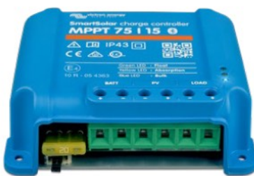
SmartSolar Charge Controller MPPT 75/15