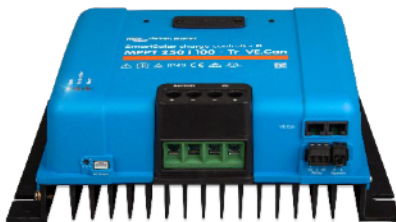
SmartSolar Charge Controller MPPT 250/100-Tr VE.Can without display