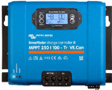
SmartSolar Charge Controller MPPT 250/100-Tr VE.Can with optional pluggable display