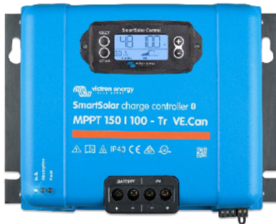
SmartSolar Charge Controller MPPT 150/100-Tr VE.Can with optional pluggable display