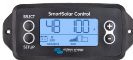
SmartSolar pluggable display