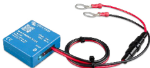
Bluetooth sensing: Smart Battery Sense