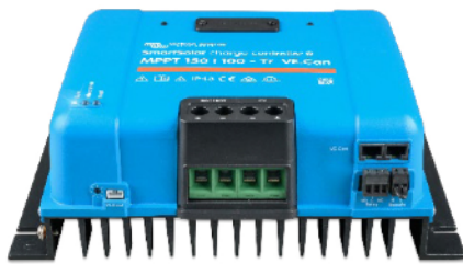
SmartSolar Charge Controller MPPT 150/100-Tr VE.Can without display