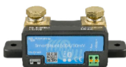
Bluetooth sensing: SmartShunt