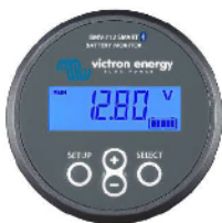
Bluetooth sensing: BMV-712 Smart Battery Monitor