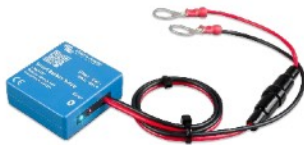
Bluetooth sensing Smart Battery Sense