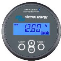
Bluetooth sensing BMV-712 Smart Battery Monitor