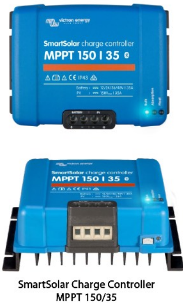
SmartSolar Charge Controller MPPT 150/35