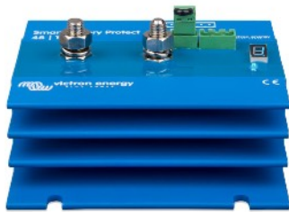
Smart BatteryProtect BP 48-100