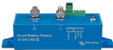
Smart BatteryProtect BP-100