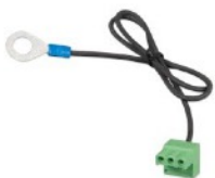
Connector with preassembled DC minus cable (included)