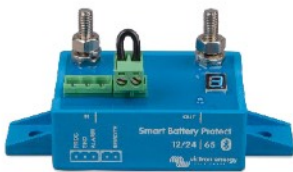
Smart BatteryProtect BP-65