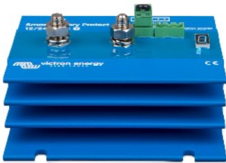
Smart BatteryProtect BP-220