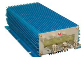
Orion IP67 24/12-100 Orion IP67 12/24-50