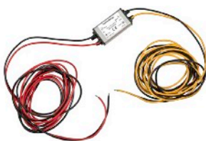
Orion IP67 24/12-5 with 1,8m cables