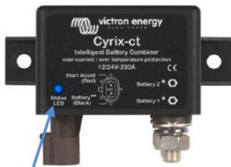
LED status indicator