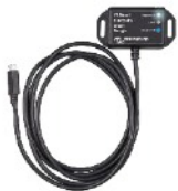
VE.Direct Bluetooth Smart Dongle