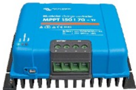
Solar Charge Controller MPPT 150/70-Tr