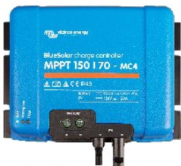
Solar Charge Controller MPPT 150/70-MC4