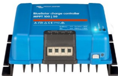
BlueSolar Charge Controller MPPT 100/50