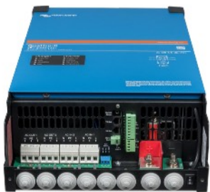
Connection Area Quattro-II 48/5k