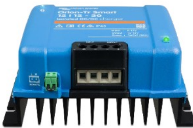
Orion-Tr Smart 12/12-30