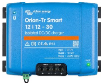
Orion-Tr Smart 12/12-30