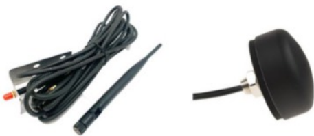
Optional Outdoor LTE-M wall-mount antenna (ANT100200100)