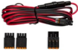
Accessories included with the GlobalLink 520