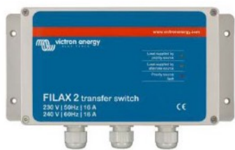
Filax 2: ultrafast transfer switch